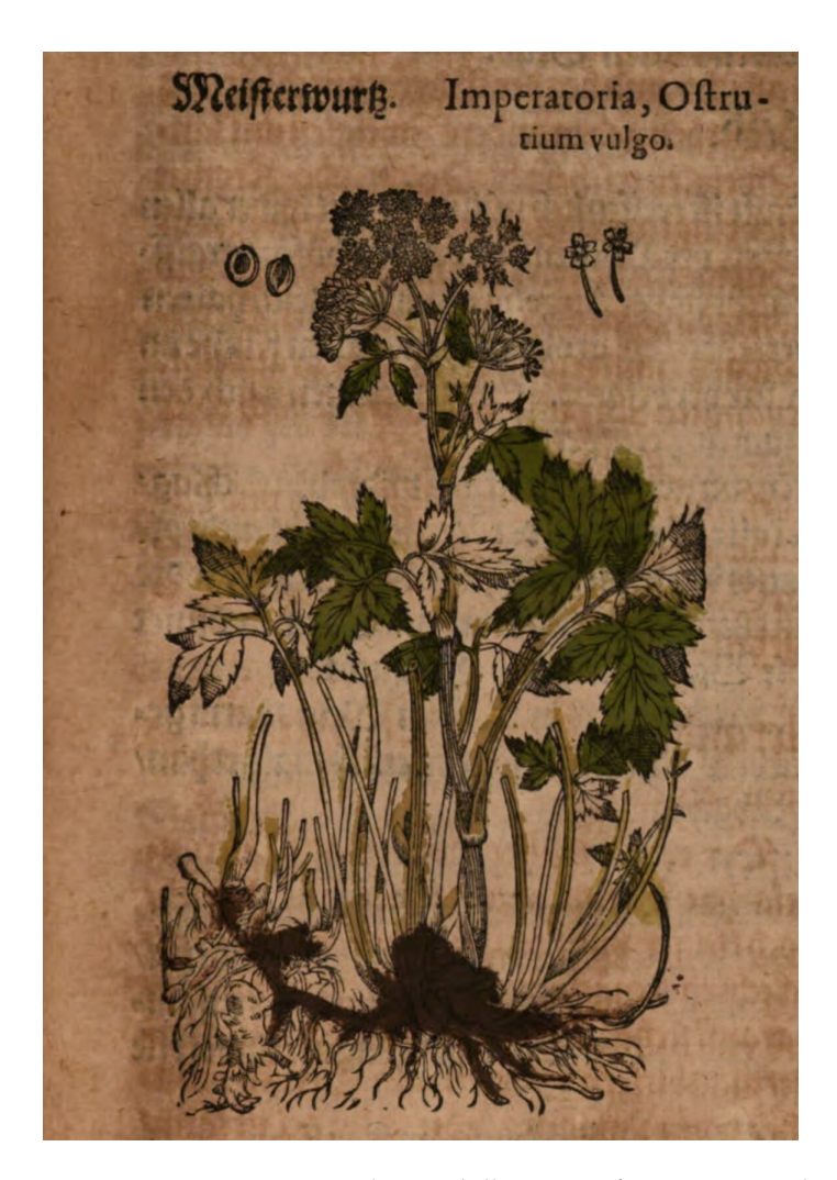
Figure 3. Masterwort in a colourised illustration from Pietro Andrea Mattioli's De plantis epitome utilissima , published by Joachim Camerarius in 1611.