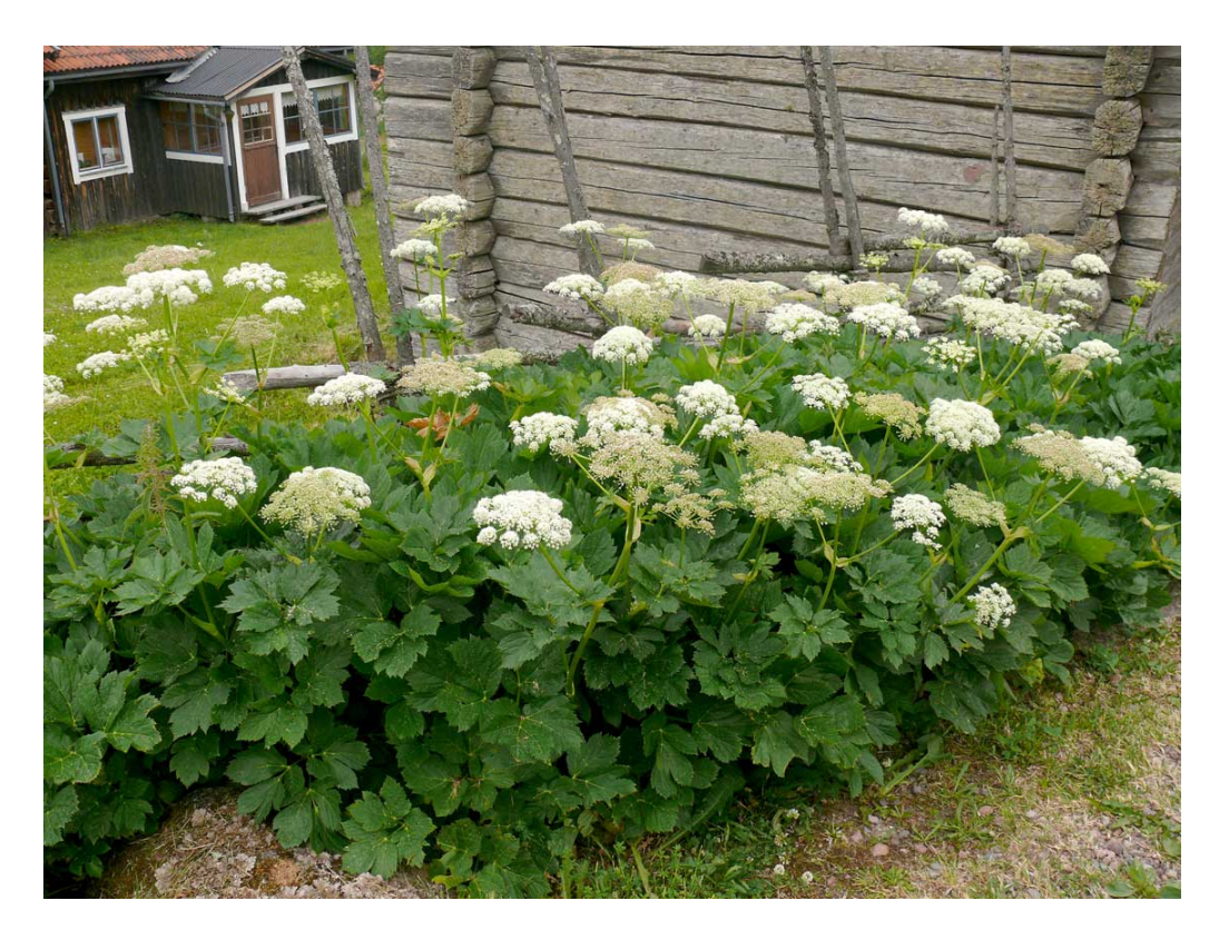
Figure 1. Peucedanum ostruthium in Orsa parish, Dalecarlia.

smoked substance for calming nosebleeds, ear pain and toothache [8]. Currently, the use of P. ostruthium is reported as a medicinal plant for human and veterinary purposes by several ethnobotanical studies in the Alpine region (i.e., in Austria [9,10], Italy [11] and Switzerland [12]) (Figure 1).