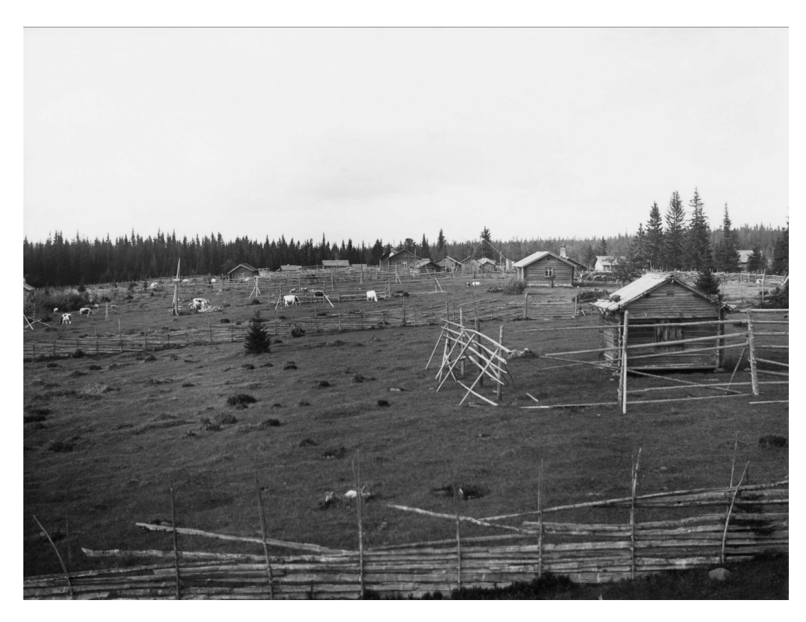
Figure 6. Pasture at the shieling Rismyren, Lima parish, Dalecarlia, in the early twentieth century (Photo Georg Renström, Courtesy: The Nordic Museum, Stockholm, NMA.0038914).