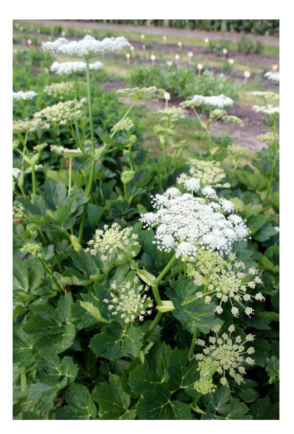
Figure 4. Peucedanum ostruthium 'Kobota'. One of the samples of masterwort collected, evaluated and described in Swedish nationwide inventories of cultivated plants.