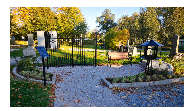
Fig. 4. A collective memorial where names of the deceased are posted on the fence.

interesting and inviting as recreational spaces.