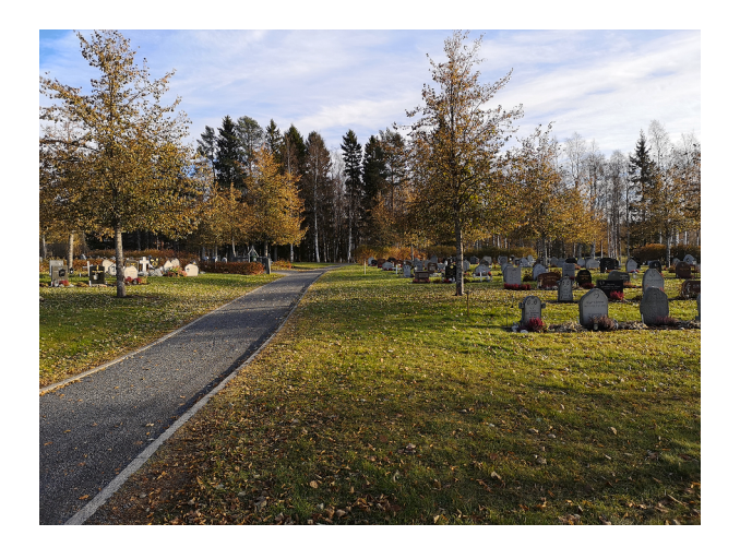
Fig. 1. A common organisation of a Scandinavian cemetery, headstones in lawn.

According to the Danish researcher Kjøller (2012), cemeteries in the Scandinavian context are neither (pure) common green spaces due to their position within the overarching framework of dealing with the deceased and the concept of death, nor are they purely religious spaces since they fall partly under the domain of green space management. As shown in other Scandinavian studies (Nordh et al., 2017a), a combination of nature, culture, history, as well as respect for the deceased and families visiting graves, has rendered a 'different green character' to the urban cemeteries, setting them apart from other green spaces in the city. However, even if they are different from parks, cemeteries have components, facilities and similarities with parks that make them both