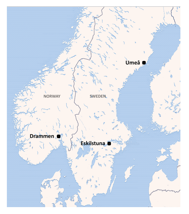
Fig. 5. The case towns under study.

and Mandee as well, whereas in Umeå, there are sections for Bahá'í and Catholics. Below we present the recruitment and interviewing processes followed by an analysis of the interviews.