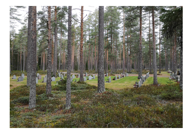
Fig. 7. An image of the woodland cemetery Röbäck in Umeå. The grave sections are integrated in nature, which explains why it may be percieved as a cemetery 'part of the surrounding nature and everyday live', as expressed by the an informant.

The cemeteries in Drammen are smaller, with less open spaces that would potentially allow for recreational activities. They have in general few design features such as water features, plantings and elements that would normally be more common in Swedish cemeteries. When we