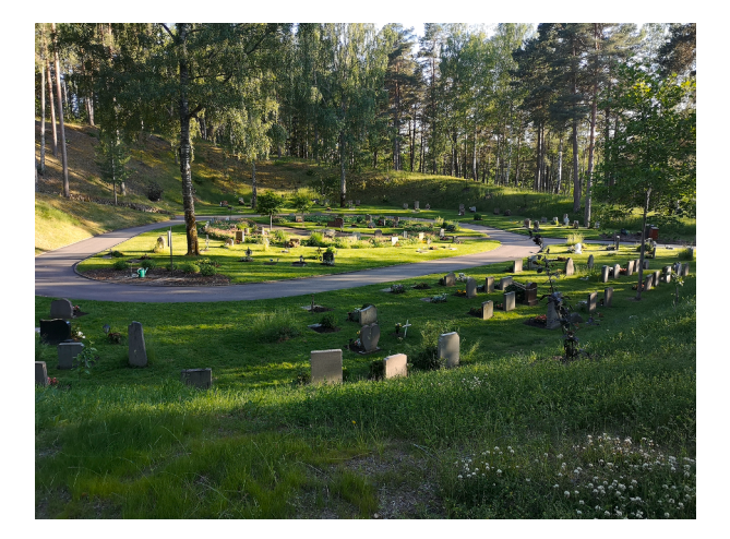
Fig. 2. A cemetery integrated in the existing landscape.