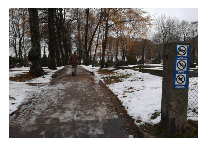
Fig. 6. The sign to the right explains that: cars are not allowed apart from goods delivery. In addition, biking and walking dogs are prohibited.

Informant: Yes I have thought of how it is perceived. But I haven't thougt of leaving him home so to say. But so far, no one has said anything, and it is, not every time, but relatively often, that one observes people with dogs there. And if they are walking to a grave or simply passing through, that I can't know, but I think the same, that the dogs do not have to pee on the headstones, or on the plantings in front of the graves [stones].