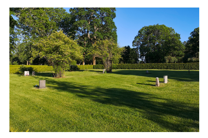
Fig. 3. A cemetery sections with few headstones left due to reuse of grave space.