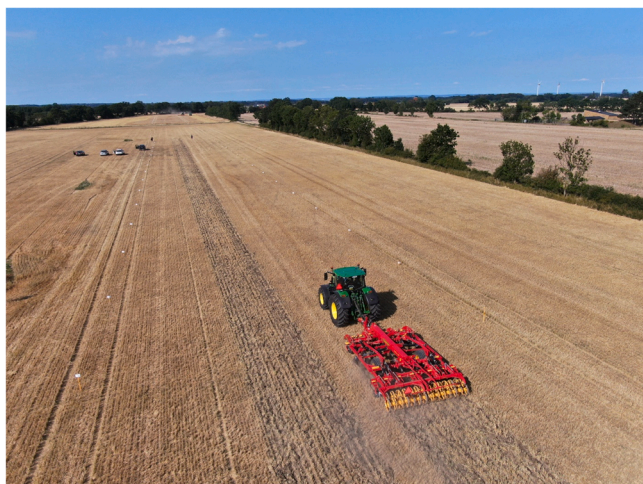
Fig. 2. Draught requirement measurements at the Hulda HP site in August 2020.

At the Kornheddinge site, two passes were made through each experimental plot with the cultivator and during each pass the draught requirement was measured for 3 s, which gave approximately 1500 measured values per pass on 6.67 m per plot. At Stureholm, Skotlandshus and Hulda, four passes were made through each plot with the cultivator and during each pass the draught requirement was measured