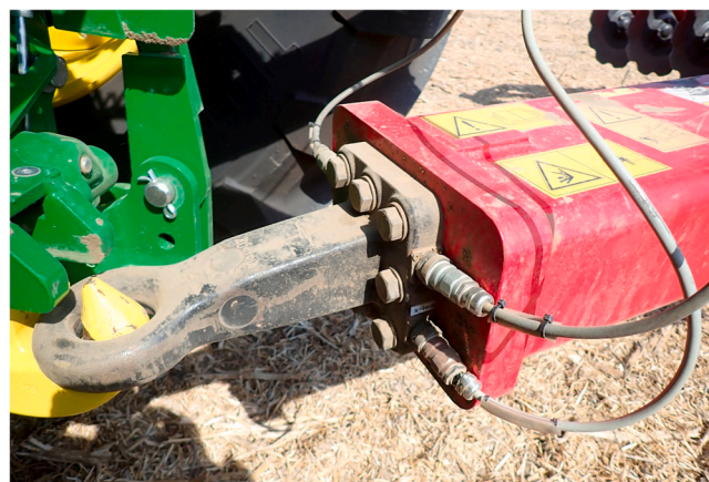
Fig. 3. The cultivator towing eye fitted with a built-in traction meter to measure forces in three directions.

for 2 s, which gave approximately 1000 measured values per pass on 4.44 m per plot. The measured values were converted to kN.