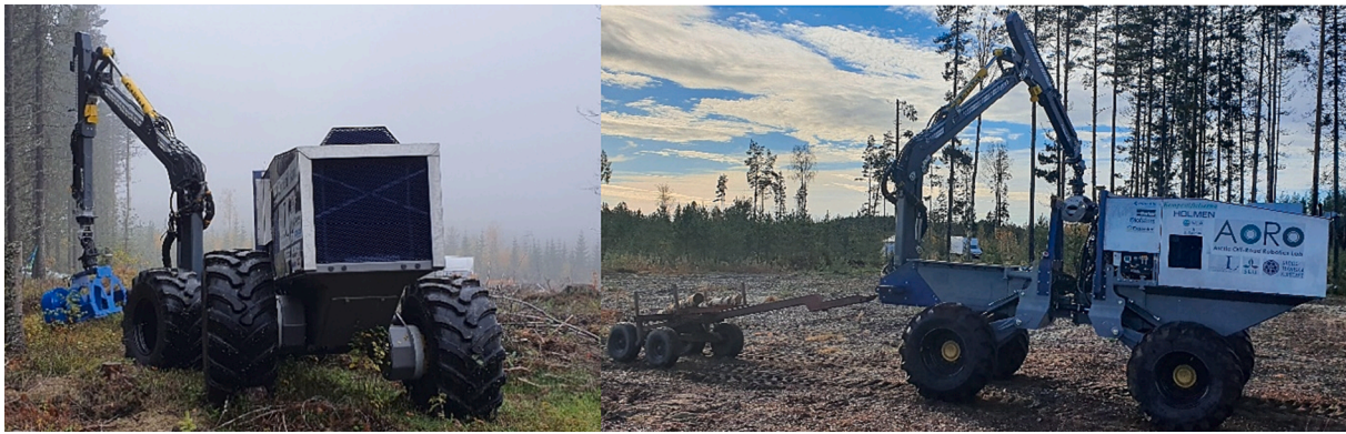
Fig. 3. The Arctic Off-Road Vehicle Platform (AORO). Autonomous tests of inverse scarification to the left (a) and forwarding demonstration to the right (b). AORO is developed in collaboration initiative between Luleå University of Technology, Swedish University of Agricultural Sciences and The Cluster of Forest Technology.

( Cronartium flaccidum ) that is spreading in many places in northern Sweden and Finland, should be removed as well to stop the infection. Doing all this also during the wintertime, when it is dark and trees are partly covered with snow, is a humanly impossible task. With the help of machine vision and automated object identification a harvester can have a 360° vision all the time that, with the help of AI and robotics, can operate the harvester to harvest trees with predefined specifications. Having this sensing capability, preceding undergrowth clearing, commonly done to help thinning operators to work efficiently, could be avoided. For example, research shows that between 10 and 70 % of penetration can be achieved with Lidar data (Chevalier et al. 2007). Consequently, when undergrowth is kept after thinning, other forestry methods such as continuous cover forestry are not disabled.