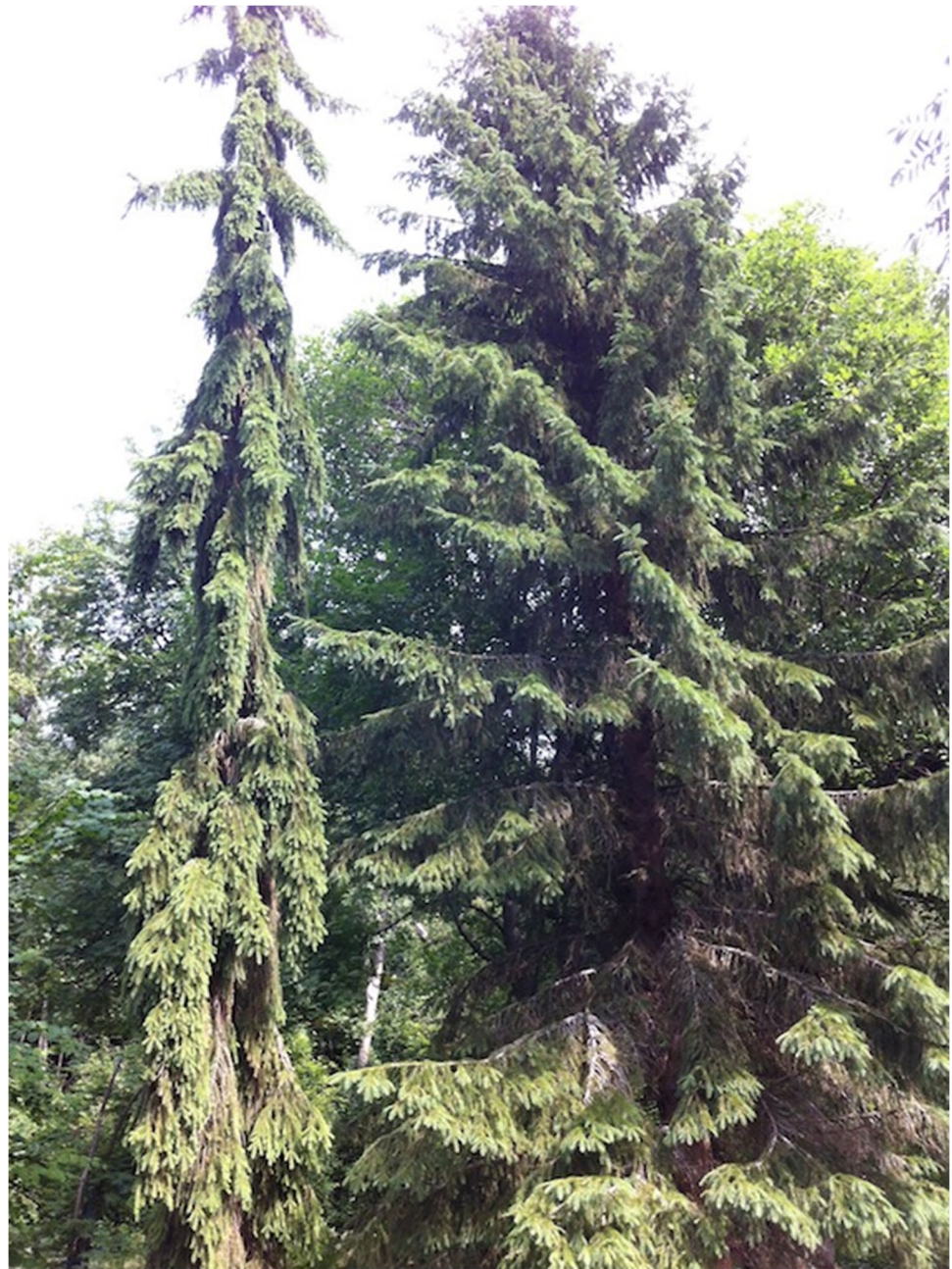
Fig. 1 Pendula (left) and regular (right) Norway spruce trees. Photo taken at Arboretum Norr in Umeå, Sweden. Photo taken by Carolina Bernhardsson, summer 2013

and Pulkkinen 1990; Pulkkinen and Poykko 1990). They also appear to be less sensitive to tree competition than normal-crowned individuals (Gerendiain et al. 2008), which suggests that they can be planted in denser stands. This mutant also appears to segregate in a 1:1 dominant segregation pattern consistent with the control of one or only a few genes with no intermediate phenotype (Karki and Tigerstedt 1985; Lepistö, 1985). However, in order to utilize the Pendula mutant in practical forestry and silviculture, a method for screening the branch phenotype at an early age is necessary. This could be done with a reliable genetic marker. An earlier study aimed at identifying such a marker was