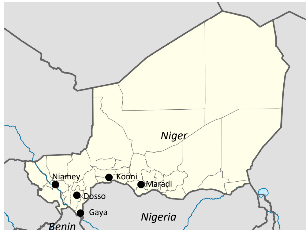
Figure 3. Locations in this study.