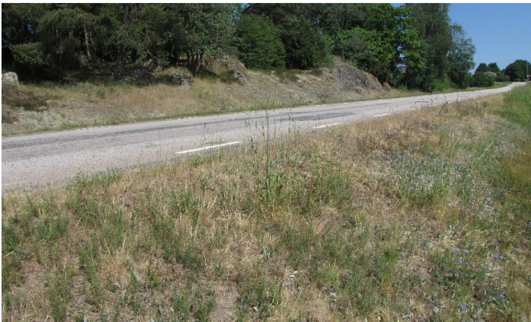
Figure 9. A certain mowing regime will show different effects on roadside plant species richness depending on productivity of the vegetation. Upper photo: nutrient-rich roadside with low species richness, Närtuna, province of Uppland, Sweden; lower photo: dry roadside, poor in nutrients but rich in species, Vedum, province of Västergötland, Sweden.