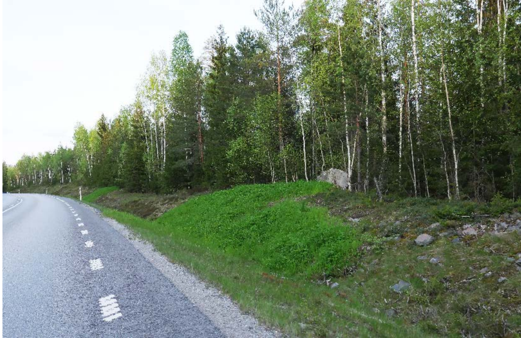
Figure 20. The topsoil may contain a species-rich seed bank, but, due to decomposition of organic matter, often becomes too nutritious for high species-richness. Vittinge, province of Västmanland, Sweden.

nitrogen deposition. Garcia-Palacios et al. (2011) studied the vegetation succession over 20 years in Spanish road verges, and found the succession towards a ‘climax vegetation’ to be accompanied by an increase in soil nitrogen and carbon due to a gradual increase of organic matter in the soil.