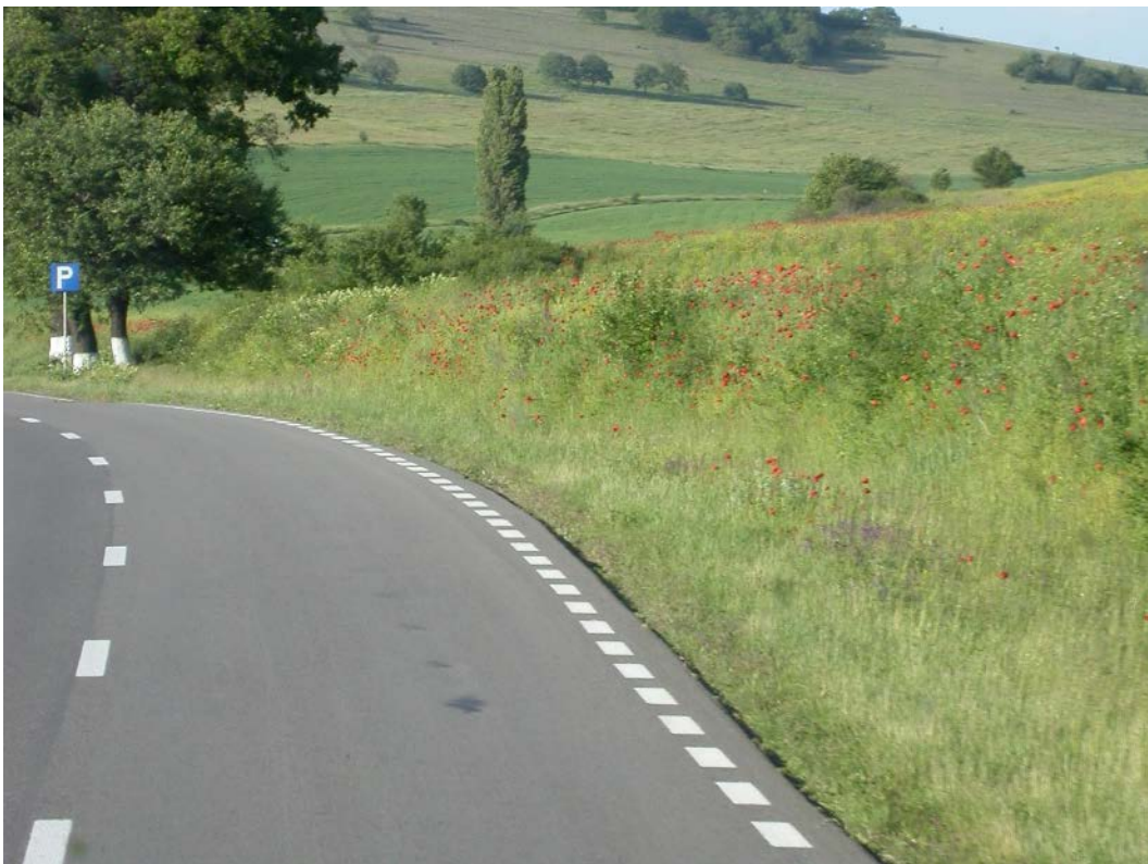
Figure 38. This road verge contains almost all species from rotational cultivation in semi-steppe. Babadag, County of Tulcea, Romania.