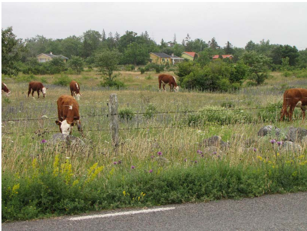
Figure 8. Calcareous semi-natural pastures are among the most species-rich grassland types. Knowledge about pasture species' responses to various environmental variables can be used to develop methods for roadside management that favour biodiversity. Byxelkrok, province of Öland, Sweden.

Since many types of roadsides can be considered grassland habitats, studies in grassland habitats other than road verges can also contribute to the knowledge of roadside ecology. Runesson (2012) and Svensson (2013) reviewed literature on the relationships between roadside management methods and biodiversity (mainly vascular plants), including studies in a wider range of grasslands, for example Natura 2000 habitats. The focus of both reviews was to inform the management of Swedish road verges, but literature from all countries and regions was reviewed.