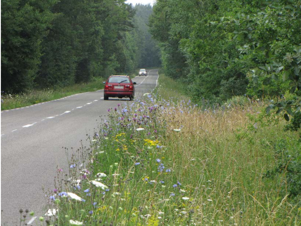
Figure 35. Road at forest edge; the shading ends the species-rich vegetation. Province of Öland, Sweden.