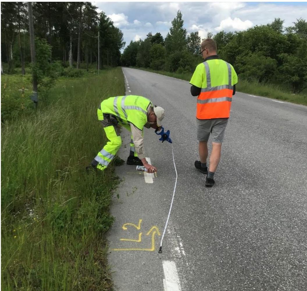
Figure 5. Roadside biodiversity field studies.

One clear result of this EPIC-roads review, as well as of many other reviews, is a scarcity of studies that follow a change over time, for example, the result of a management practice. Of the 91 studies reviewed by Villemey et al. (2018) all but three used experiment-control design, not before-after design (or before-after-control design).