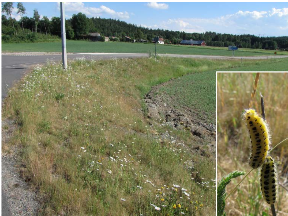
Figure 17. With suitable vegetation, roadside habitats can serve as reproduction habitats for invertebrates, here larvae of burnet ( Zygaena sp.). Borås, province of Västergötland, Sweden.

In the Netherlands, the two butterfly species Maculinea nausithous and M. teleius were re-introduced in 1990 and their populations studied over nearly a decade (van Langevelde and Wynhoff 2009). The two species typically occur in fragmented habitats and they depend on plots with both host plants and host ant nests as larval resources. The authors found that the spatial arrangement of the habitats limited their dispersal, but in different ways. M. teleius only flew shorter distances, and expansion of a population could only occur to high-quality patches in close proximity. In contrast, M. nausithous could cover larger distances and therefore had the ability to utilize a network of high-quality habitats further away in the landscape, for example in road verges.