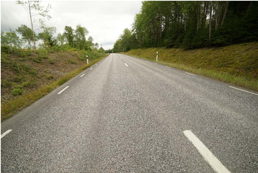
Figure 25. North- and south-facing slopes experience very different climatic conditions, which is reflected in the vegetation. Here, the north-facing slope (to the right) is dominated by few species of mosses while the south-facing slope has a rather species-rich flora of vascular plants, especially species adapted to sun and drought. The sun exposed slope has sparse vegetation cover, which favours wild bees and other digging insects. Arlanda, province of Uppland, Sweden.

cover of vegetation in south-facing slopes, compared to 78% in north-facing slopes. Several studies from ecosystems other than road environments indicated that evapotranspiration is one of the main mechanisms for the effect of slope angle and aspect on vegetation (Cerdà 1998; Kuitel and Lavee 1999; Bennie et al. 2006). The ecological effects of slope properties are therefore linked to and interacting with effects of sun, temperature, drought, and ground disturbance by erosion. Due to erosion risks, the benefits of creating slopes for biodiversity are often seen as problematic in practical road administration, and the flattest possible slopes are therefore recommended (Johnson 2008). There are rather few studies on aspect effects on roadside vegetation; only seven articles were found in our screening. Some of these studies failed to prove significant aspect effects when testing for effects of several environmental variables simultaneously (e.g. Cousins and Eriksson 2001; Akbar et al. 2010). Such results cannot, however, be interpreted without knowledge about which type of slopes were studied.