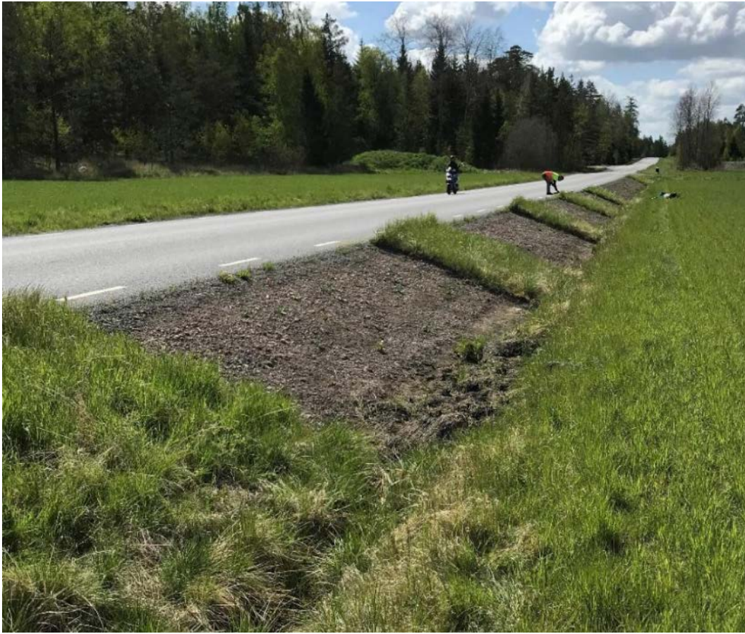
Figure 42. Experimental scraping and unscraped islands of vegetation. Uppsala, province of Uppland, Sweden.