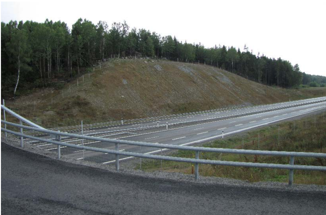
Figure 31. Large slope with local nutrient-poor soil, good potential for slow succession and species-rich dry vegetation. Överfors, province of Södermanland, Sweden.

Dry conditions are caused by the combination of low water supply (from rain and/or ground water), low water content in the soil (by coarse material causing low water retention capacity, or thin soil that rapidly dries), and high evapotranspiration (through warm climate and/or microclimate). As discussed earlier, the soil moisture can be considered a fundamental condition for determining the vegetation and can be regarded as a stress factor. In addition, dry conditions increase the risk of shorter periods of drought, here defined as periods much drier than the average, which kills some of the vegetation. Drought is thus a process that could open the sward and cause rapid changes of the habitat similar to physical disturbance to the ground.