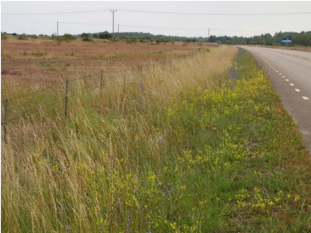
Figure 30. In this case, early cutting next to the road has increased plant species richness by suppressing competitive grasses, here Arrhenatherum elatius , compared with later cutting. Södvik, province of Öland, Sweden.

These examples show that the timing of cutting may have contrasting effects on plants in different types of roadside habitats and different landscapes, and that timing of cutting should be adapted to the habitat and its species in order to favour biodiversity. For example, early cutting in Portuguese road verges has been shown not to influence the seed production of Mediterranean plant species negatively (Simões et al. 2013). This is largely because early cutting resembles the traditional grazing that has formed the surrounding habitats and their flora.