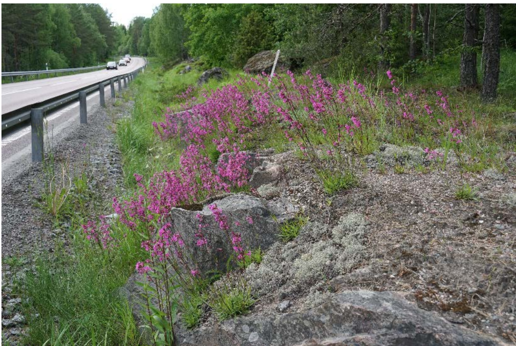
Figure 12. A typical structure in roadsides through rocky terrain is bare bedrock with no or thin soil cover. Many plant species adapted to such microhabitats are spring-flowering, thereby taking advantage of the soil moisture before the summer heat. Viscaria vulgaris , Gölja, province of Västmanland, Sweden.

In summary, although many studies of biodiversity in roadsides test correlations between biodiversity and different habitat features, there is a large need for reviews and studies of mechanisms for the relationships between species and their microhabitats. In particular, the importance of basic environmental conditions (climate, soil type, sun exposure, species pool etc.) and different processes (natural and anthropogenic ones, e.g. vegetation management, soil disturbance etc.), needs to be highlighted.