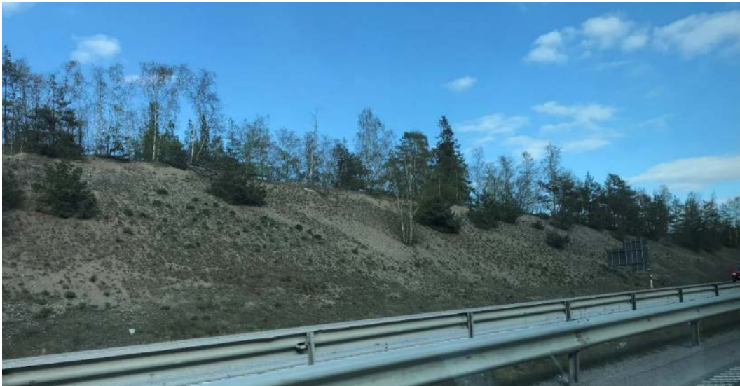
Figure 22. Dry, sun-exposed slope along motorway. Bålsta, province of Uppland, Sweden.

and diversity of herbs and graminoids (and invertebrates) in many studies. For example, in a Japanese study, roadsides were compared with natural vegetation along an altitudinal gradient (Takahashi and Miyajima 2010). The species composition was clearly affected by light conditions. At altitudes below the timberline, roadsides constituted canopy openings compared to the adjacent forest canopy. Light-demanding plant species dominated in the roadsides irrespective of altitude, and in the natural vegetation they increased with altitude as canopy cover decreased.