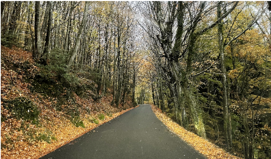
Figure 16. A narrow road through a forest hardly constitutes a barrier for birds and flying insects dwelling in the canopy. For ground-living species, on the other hand, the paved road is a very different environment compared to the forest floor. Ferrals-les Montagnes, department of Hérault, France.

Roads are known to contribute to the fragmentation of habitats in the landscape, and function as barriers for the movement and dispersal of animals. Barrier effects have mainly been studied for (large) vertebrates, but there are also examples of effects on insects (see review in Muñoz et al. 2015; see also Delgado et al. 2013a and b). These reviews show that several road-related factors contribute to increasing habitat fragmentation, of which the most important seems to be vehicle-caused mortality, barrier effects, edge effects and habitat loss.