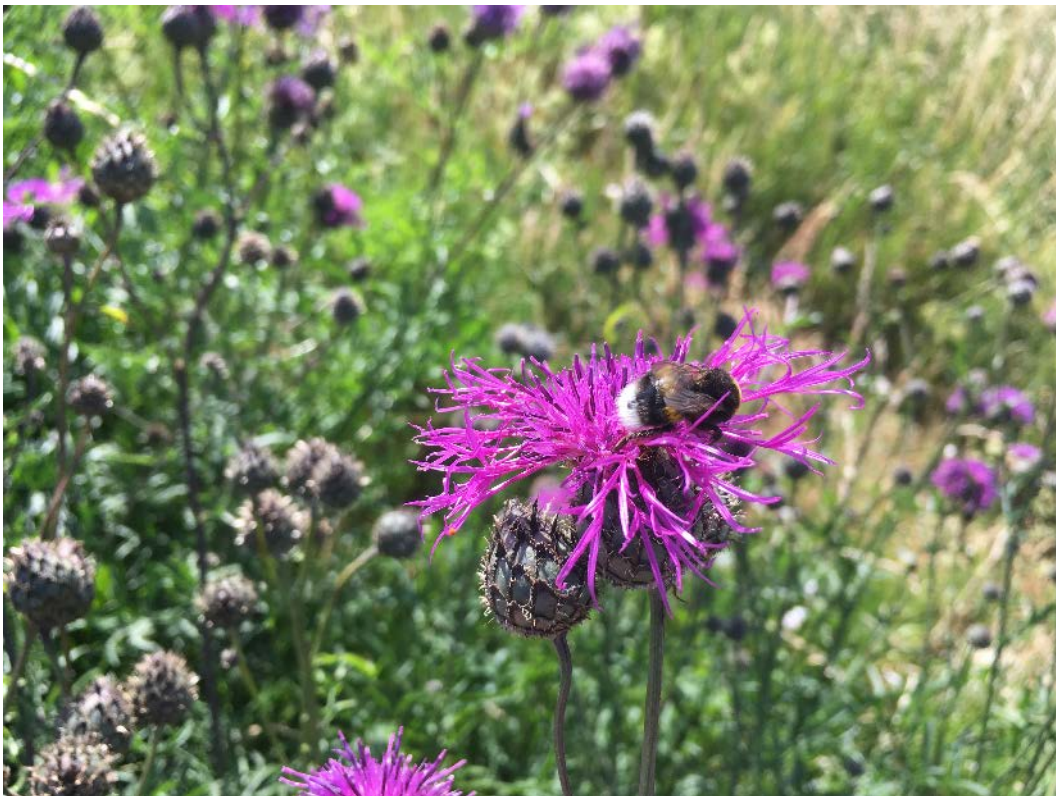
Figure 15. Bumblebee on Centaurea scabiosa. Province of Uppland, Sweden.

Van Halder et al. (2017) found a higher butterfly species richness in grazed grasslands compared to linear elements such as road verges and grassland strips between arable plots in three agricultural areas of France. Grasslands supported more specialised, more sedentary and less fecund species, which, according to the authors, underlines the more important role of grasslands compared to linear habitats, as habitats for specialist and threatened species. Road verges and other linear habitats supported more generalist species. In another study, diversity of dung-beetles was reduced up to 170 m from forest roads in a rainforest landscape of Borneo, Malaysia, was largely attributed to reduced abundance of specialist species (Edwards et al. 2017).