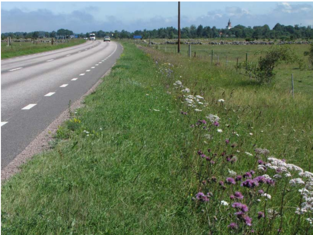
Figure 29. Early cutting next to the road has reduced flower abundance and (most likely) plant species richness compared with later cutting. Province of Öland, Sweden.

In contrast, some studies have found more positive effects of early cutting. For example, Chaudron et al. (2018a) showed that a single early cutting of road verges promoted higher species richness in agricultural landscapes in mid-western France compared to late cutting practices. Late cutting mostly favoured nitrophilous and competitive species that were also present in the field margins. Baum and Sharber (2012) noticed that summer cutting of road verges in the Great Plains of Oklahoma, USA, made milkweed ( Asclepias viridis ) produce a new burst of shoots in August–September, at a time when undisturbed milkweed plants had senesced. Such late appearance of milkweed was identified as a benefit to monarch butterflies ( Danaus plexippus ), which uses different milkweed species as their sole host plant. This positive effect of cutting for monarch butterflies has also been demonstrated by cutting experiments in habitats other than road verges (Fischer et al. 2015), as well as by experimental summer burning. Re-flowering after early cutting was shown also by Noordijk et al. (2009b) in the Netherlands. In that study, pollinators responded positively to cutting twice a year (with removal of the cut vegetation) in productive road verges, because that type of cutting regime promotes the highest flowering. The early cutting triggered reflowering later in the season.