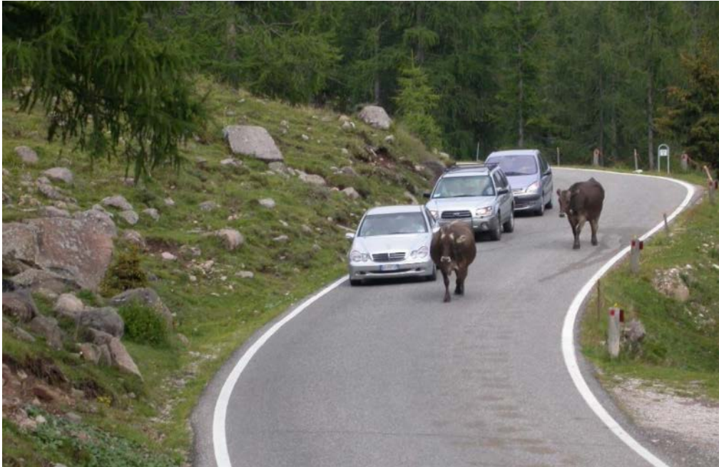
Figure 37. Roads running through active semi-natural pastures may harbour a large proportion of the pasture biodiversity. Province of Belluno, Italy.

species of these habitats (Forman and Alexander 1998; Lunt and Bennett 2000; Spooner 2015). On the other hand, other types of roadside management that are less similar to natural disturbance regimes may have negative impact on biodiversity. One example is mowing, which has been shown to have negative impacts on plant species richness in some Australian landscapes (see review by Forman and Alexander 1998). In Brazil, road verges harbour 70% of the plant species found in Cerrado wooded savanna (Vasconcelos et al. 2014).