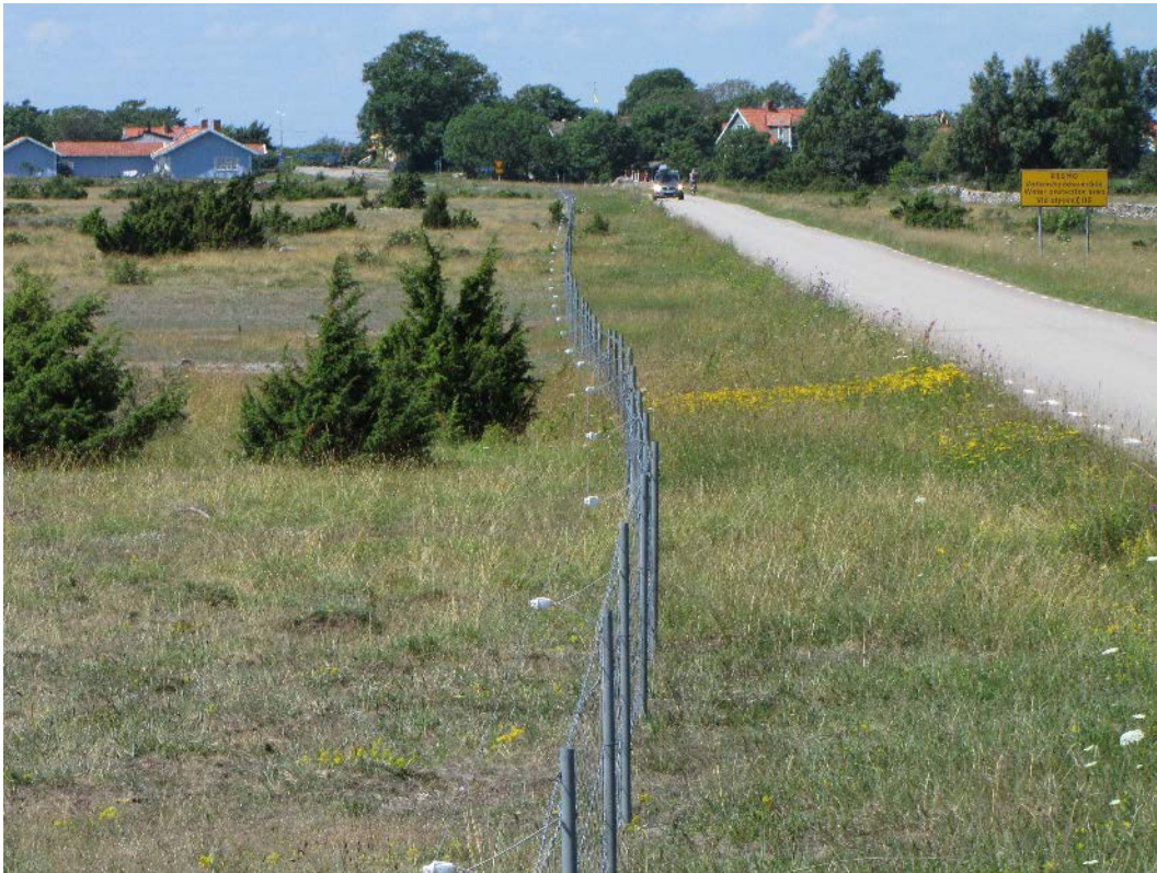
Figure 26. The road corridor has become a rescue for the important host plant Inula salicina and accordingly also for its insects. Inula cannot stand high grazing pressure. Province of Öland, Sweden.

reduce plant species richness, and the fact that few insects utilize non-native flowering herbs.