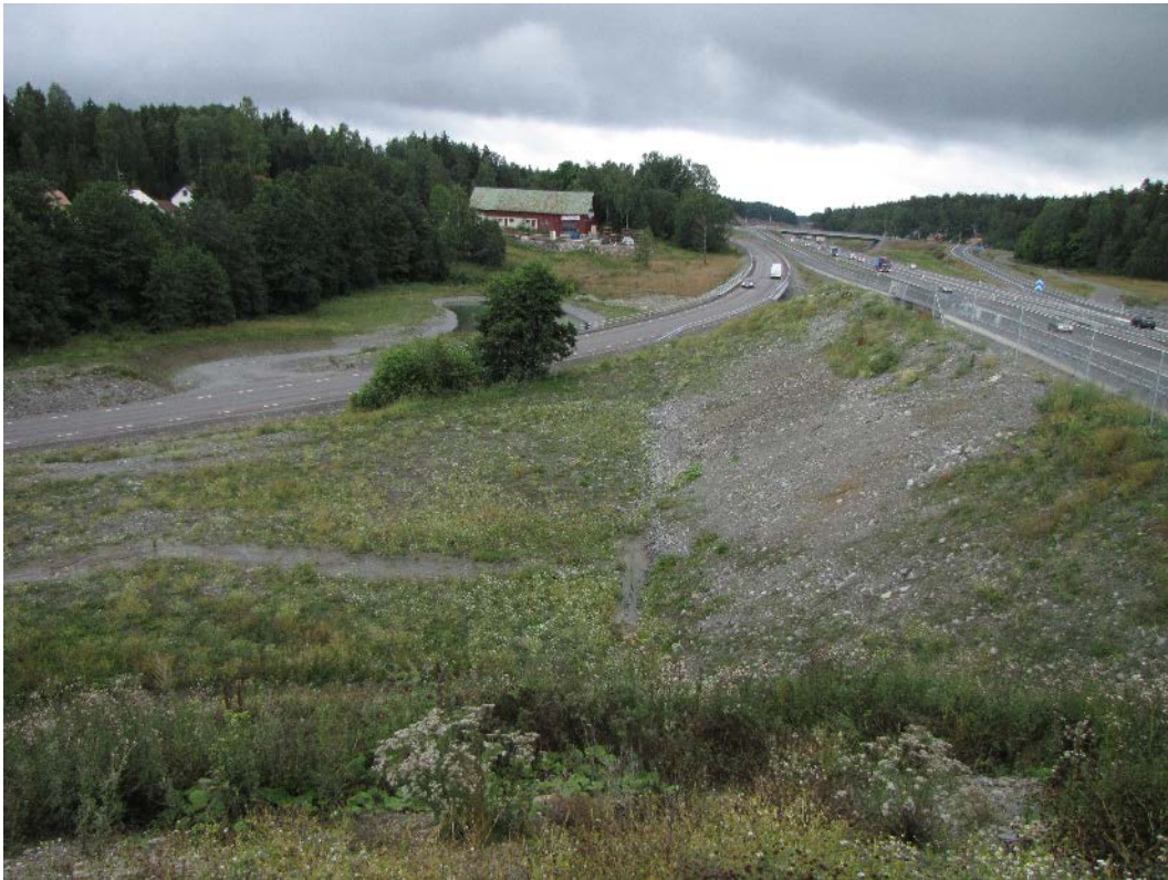
Figure 34. Recently constructed road, with good potential for slow succession both in the slope and flat area. Överfors, province of Södermanland, Sweden.

The study by Ross (1986) of primary succession in Scottish road verges illustrates how the number of species first increases through establishment of new species, and then decreases due to vegetation management (e.g. mowing and herbicides), and through competition. The studied highway was constructed in 1969 and the species composition was recorded 10 and 20 years after construction. Four species of grasses together with white clover were sown at construction. After 10 years, 84 vascular plant species were found, and after 20 years 68 species; 71 new dicots established during the first ten years, but in 1984, only 44 dicots remained. During the last 10 years, the number of grass species increased from nine to 13 species and the number of bryophytes from none to nine. The study also indicates that many of the species that entered the verge habitats during the first 10 years, continued to spread along the road to new verge microsites during the following 10 years. A similar result was found in a study of plant diversity in a Chinese delta area (Zeng et al. 2010, 2011). The vegetation in this highly dynamic area is characterised by primary succession, and the disturbance along the roads favoured plant diversity, of which about 75% of the plant species in the roadside habitats were native plants. The native plant species