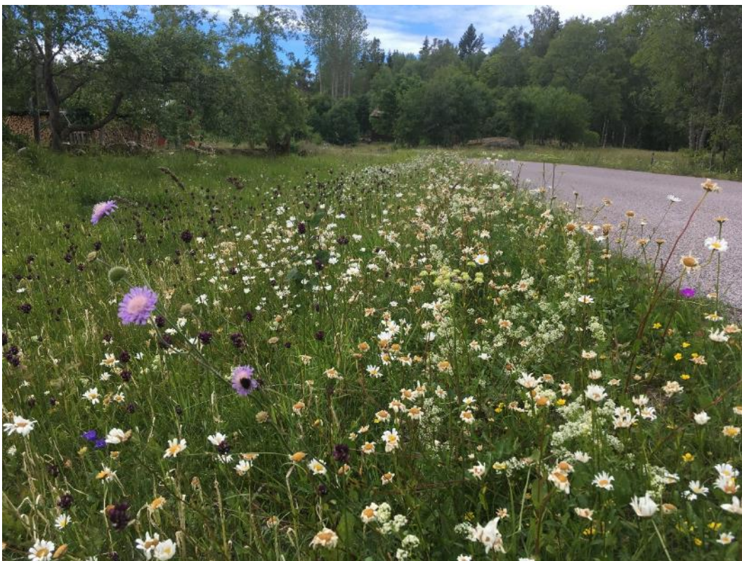
Figure 1. Flower-rich road verge, Gräsö island, province of Uppland, Sweden.

Third , we have interpreted the key results in an applied perspective, in particular their implications for construction and maintenance of road verges.