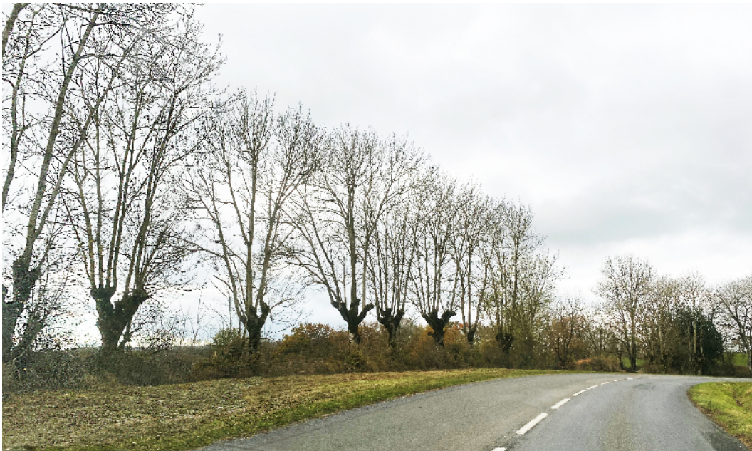
Figure 23. Old pollards are light-demanding and can survive in tree rows and forest edges along roads. Saint-Léons, department of Aveyron, France.