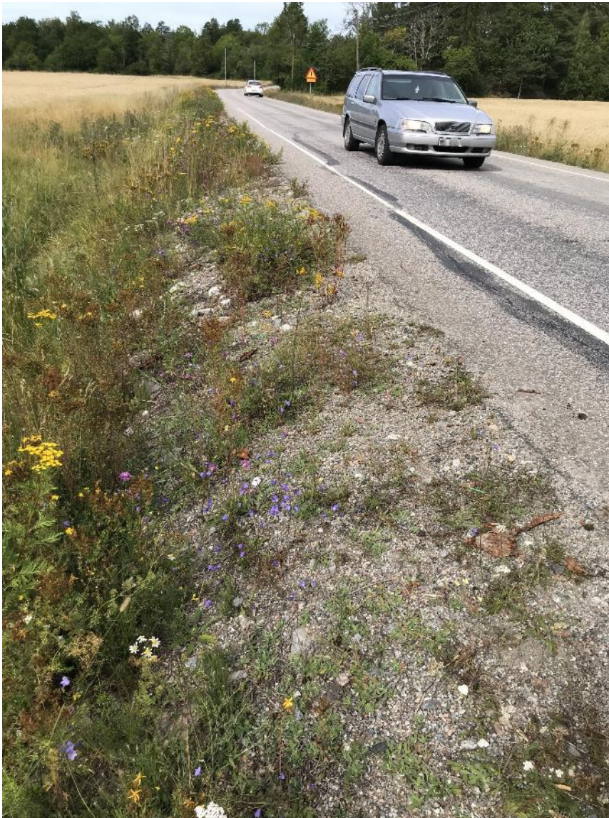
Figure 21. Sun-exposed road verge with sparse vegetation and a large proportion of bare soil. Mariefred, province of Södermanland, Sweden.

combination with sowing (e.g. Johnson 2008). It has been questioned how efficient such measures are in roadside conditions where drought and high temperatures may disfavour those fast-growing species that are favoured by high nutrient levels. Hillhouse et al. (2018) evaluated the effects of nitrogen and phosphorus fertilization on the foliar cover of species planted into two roadside sites in eastern Nebraska, USA. They found no effect of fertilisation on foliar cover or erosion because the fertilisation protocols were developed for fast-growing cool-season plant species.