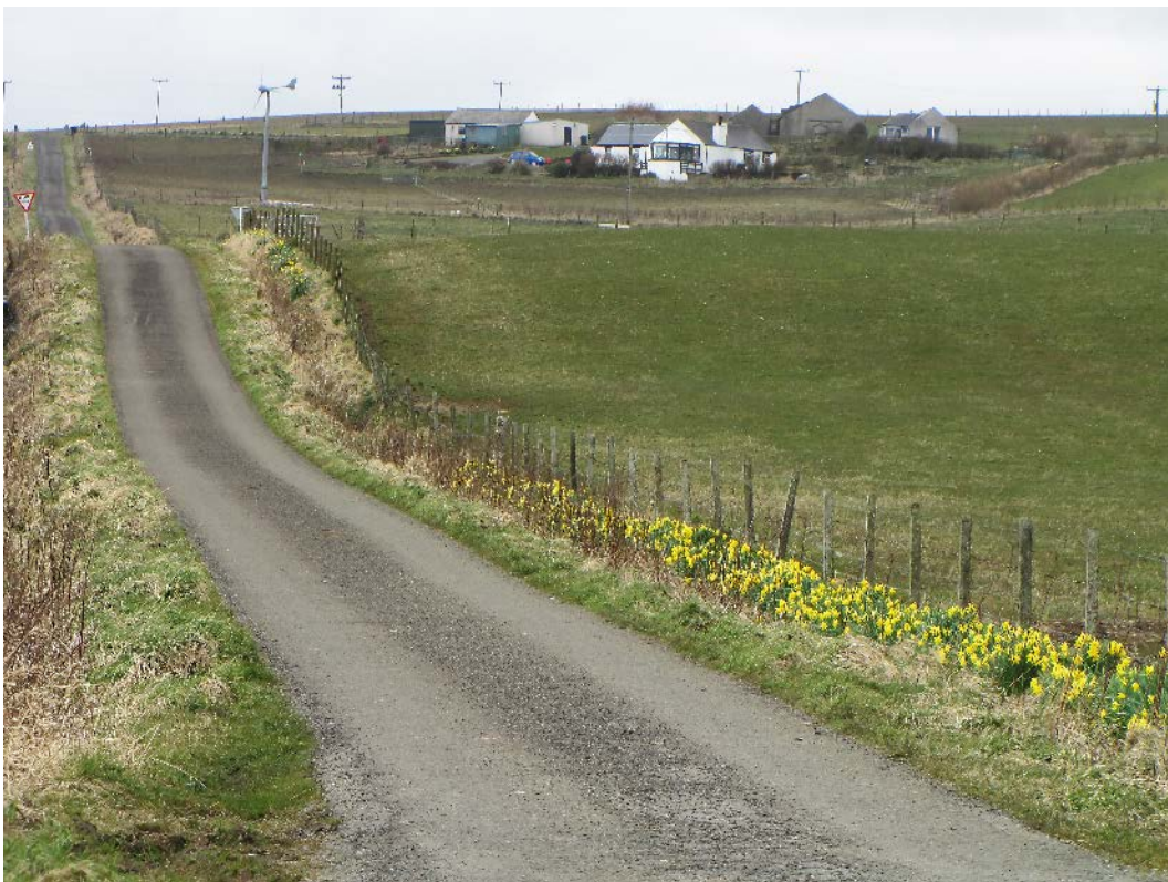
Figure 13. Daffodils are spreading along roadsides, Mainland Orkney Islands, Scotland.

Higher diversity and species richness are not necessarily indicators of better conservation status, habitat quality, or higher conservation value. Increased diversity and richness may be caused by the road introducing new conditions and microhabitats in the landscape. This creates new niches for other species than those occurring in the undisturbed landscape, including ‘alien’, or ‘exotic’, species of distant origin, some of which may be invasive. For example, in a French oak forest, the roads constituted the least common type of human-made habitat but contributed most (82%) to the diversity of vascular plants, through introducing native non-forest species (Baltzinger et al. 2011). Schultz et al. (2014) found roadsides in Australia to be the habitats contributing most to the diversity of exotic species in a mixed agricultural landscape. In the review by Suárez-Esteban et al. (2016), much of the enhanced diversity in roadsides was due to colonisation by non-local species, while the authors noted that the studies had a bias towards exotic species.