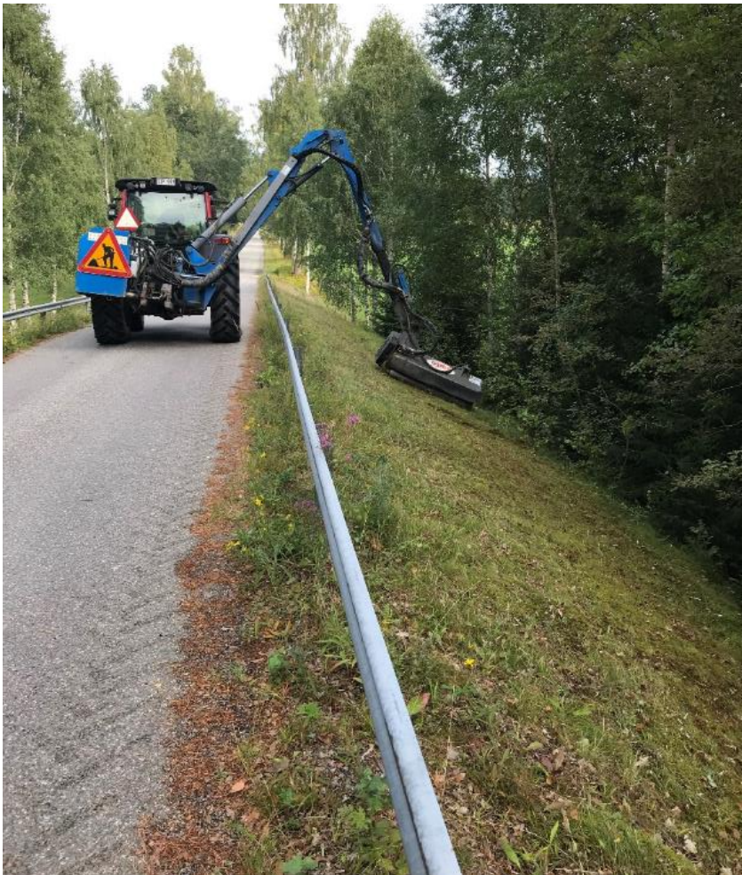
Figure 6. Standard roadside vegetation cutting. Grönbo, province of Västmanland, Sweden.

If biodiversity is mentioned as a goal for adapted cutting regimes, increased flower richness and plant species richness are common targets. Another common target is establishment of native vegetation, e.g. prairie vegetation (Johnson 2008), heathland vegetation (Heemsbergen et al. 1989), or xerothermic habitats (Murariu et al. 2019). Guidelines also address favouring of ground-nesting birds (Johnson 2008) and pollinators (Hopwood 2010; van Rooij et al. 2014; Galea et al. 2016; Fox et al. 2019).