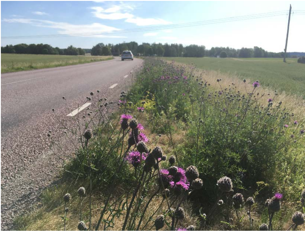
Figure 14. The role of road verges as a habitat for invertebrates is increasingly important in heavily managed agricultural areas. Road verge with Centaurea scabiosa, an important plant for many pollinators. Province of Uppland, Sweden.

even country, and the species today may be regarded as ‘roadside specialists’ (e.g. Schultz et al. 2014; Helldin et al. 2015).