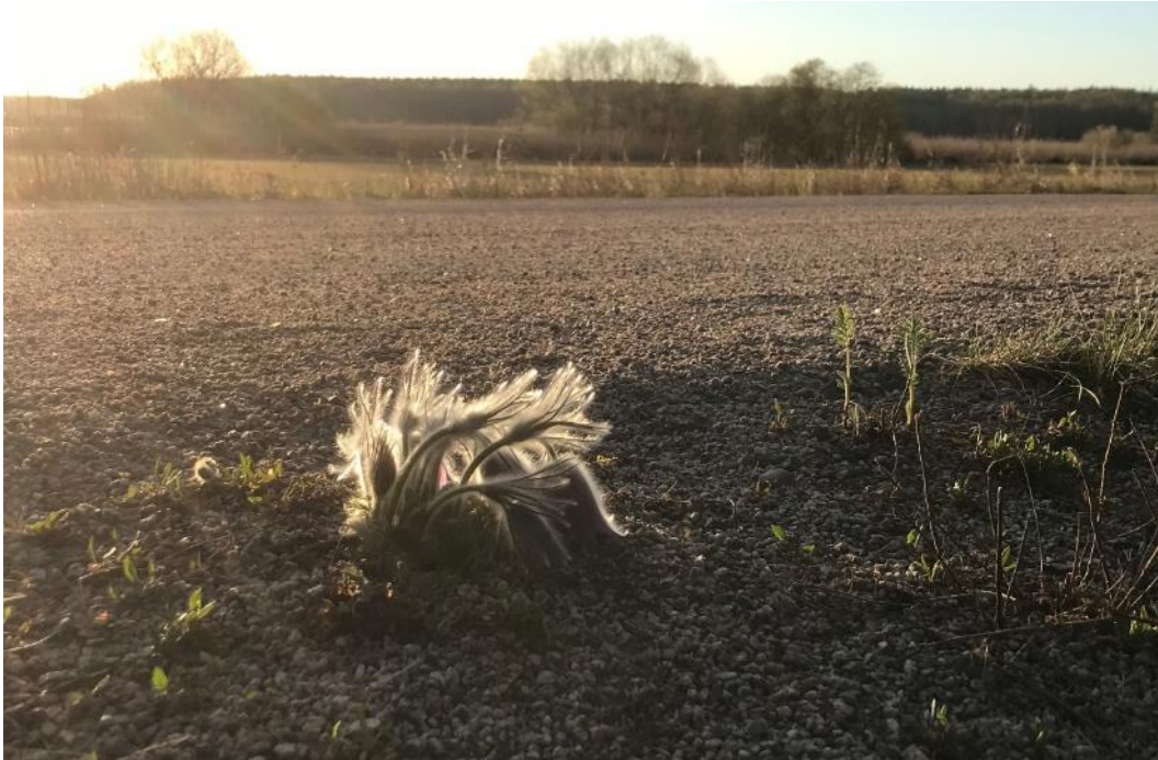
Figure 32. Pulsatilla vulgaris in road verge. Uppsala, province of Uppland, Sweden.

surprising as endemic plants on isolated islands are usually considered to be disfavoured by human presence. The authors interpreted the effects as the result of new cliff surfaces in the road construction, in combination with the protection from negative disturbances such as fire and grazing by introduced herbivores, mainly rabbits and goats.