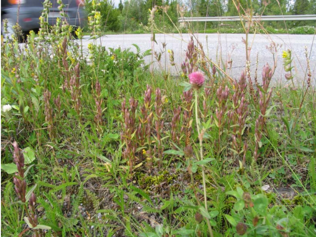
Figure 10. Gentianella amarella, province of Härjedalen, Sweden.

It has been suggested that the importance of roadsides for conservation may have been overlooked. Rentch et al. (2013) claim that roadsides have largely been excluded from vegetation studies in the USA because they have been considered as unnatural or wasteland. However, in their study of vascular plants flora of roadside habitats in West Virginia, USA, they documented 467 species of which 325 were natives.