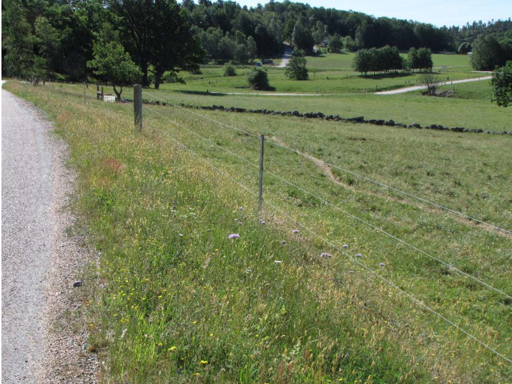
Figure 36. In this case, the roadside habitat can be seen as an extension of the grazed pasture, but better for mowing-adapted early-flowering species. Orust, province of Bohuslän, Sweden.

than the surrounding landscape, and they may mainly have negative effects on the indigenous biodiversity, through reducing the area of (forest) habitats and favouring non-local species, including species that threaten local biodiversity (cf. sections 3.1 and 3.2).