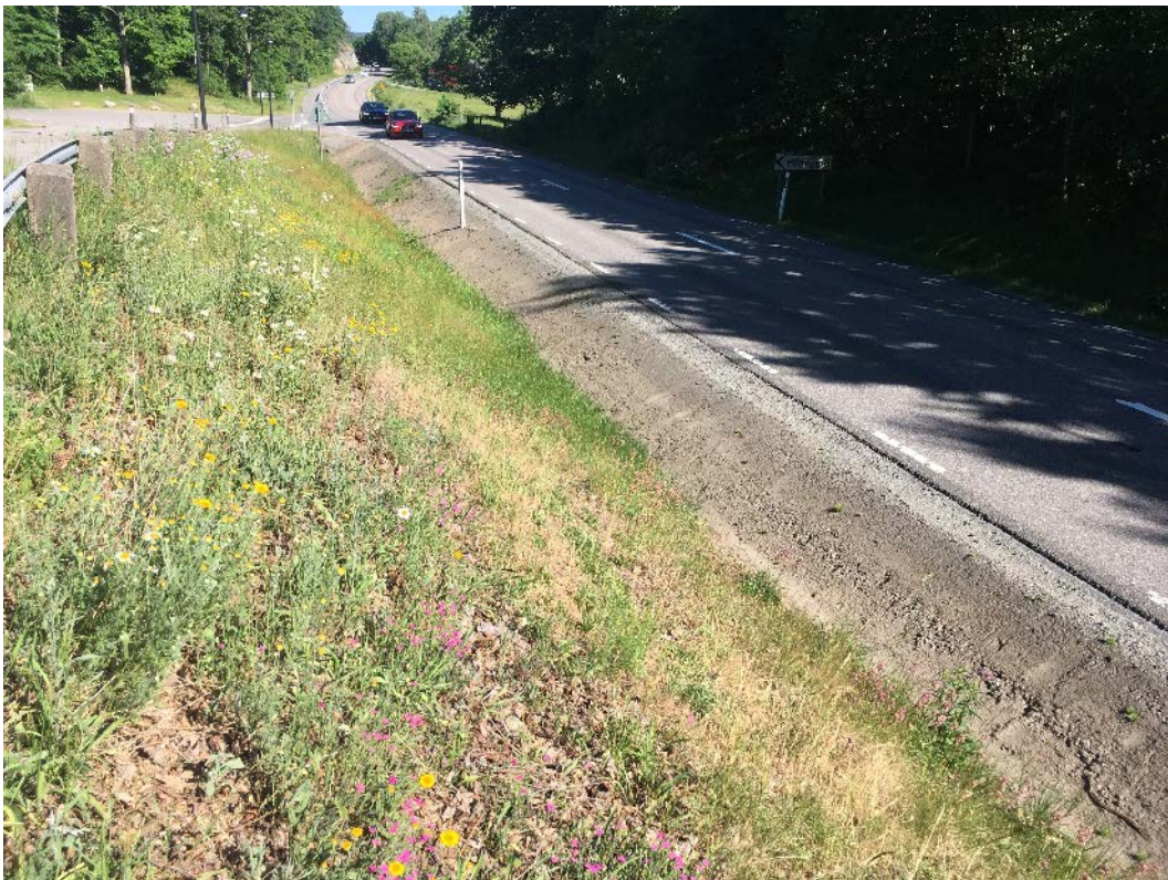
Figure 28. Recently graded road embankment. Province of Bohuslän, Sweden.

In many contexts disturbance is something negative that should be avoided. In plant ecology, however, it is not. On the contrary, a wide range of habitats are formed and maintained by certain types of disturbance, and, consequently, a large number of species are adapted to and dependent on disturbance. A key task in biodiversity conservation is often to restore disturbance regimes, either natural, such as fire regime in boreal forest or flooding regime in a river, or semi-natural, such as traditional grazing and mowing regimes in pastures and hay meadows. Disturbances may be frequent and regular, such as annual mowing, or less frequent, such as grading of embankment and ditches, or drought episodes. Roadside management is a disturbance regime that influences both ground and vegetation, and is a prerequisite for roadside habitats and their biodiversity.