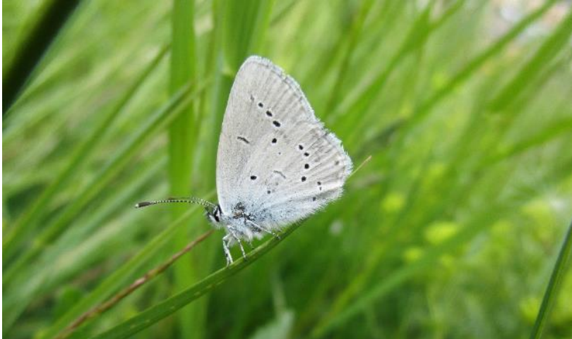
Figure 3. Small blue Cupido minimus .