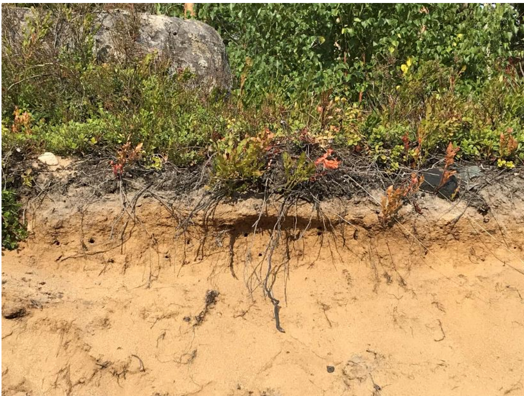
Figure 39. Sandy roadside slope with frequent nest cavities for digging insects. Lindesberg, province of Västmanland, Sweden.

Considering that road construction includes considerable manipulation of the soil, and creates escarpments and embankments with new and often designed soil surfaces, better knowledge of relationships between soil properties and roadside vegetation and invertebrate fauna is crucial in order to favour roadside biodiversity. We encourage specific reviews of literature on soil–vegetation and soil–invertebrate relationships, as well as new research, preferably with a focus on biodiversity conservation issues.