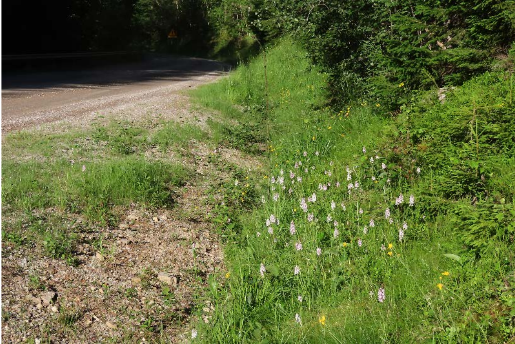
Figure 18. Roadside ditches can occasionally develop certain types of fen vegetation which, together with openness, favour wetland plants, e.g. the orchid Dactylorhiza maculata. Norberg, province of Västmanland, Sweden.

locally rare species in roadside ditches in Poland, 46% of which only occurred in these roadside habitats. Swengel and Swengel (2011) showed that bog butterflies in Wisconsin, USA, frequently visited lowland ditches along roadsides, and that they utilized a variety of nectar sources.