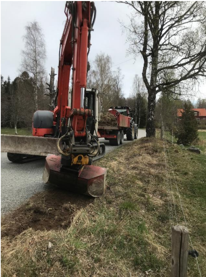
Figure 41. Regular road maintenance include many activities that cause physical disturbance to the ground and field layer. Grönbo, province of Västmanland, Sweden.

This review has found several studies that implicitly, but rarely explicitly, indicate that mechanical disturbance of the ground is an important ecological process in roadside environments, and that many species-rich roadside habitats are formed and maintained by such disturbance. A systematic approach to research on ground disturbance in roadside habitats is however lacking, which we believe constitutes a critical deficit in our knowledge about roadside ecology.