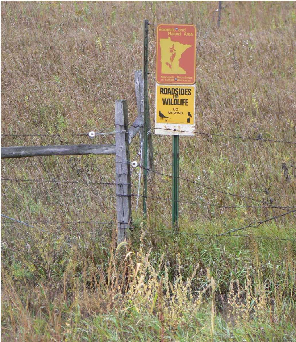
Figure 2. Signage for conservation roadsides in Minnesota, USA.

Another example of practical-economic motives for a conservation interest in road verges is provided by Vasconcelos et al. (2014), who studied plant diversity in Brazilian Cerrado wooded savanna – a hotspot in biodiversity conservation. They found that the number of species was lower in road corridors through the savanna compared to natural vegetation in reserves, especially the number of forest species and Cerrado specialist species. However, 70% of the 108 species found in the savanna also occurred in the roadsides. Considering the continuous pressure on the Cerrado biome from different types of land use, which leads to the decline of many species, and considering the large total area of road corridors, the authors concluded that roadside habitats may be important for preserving