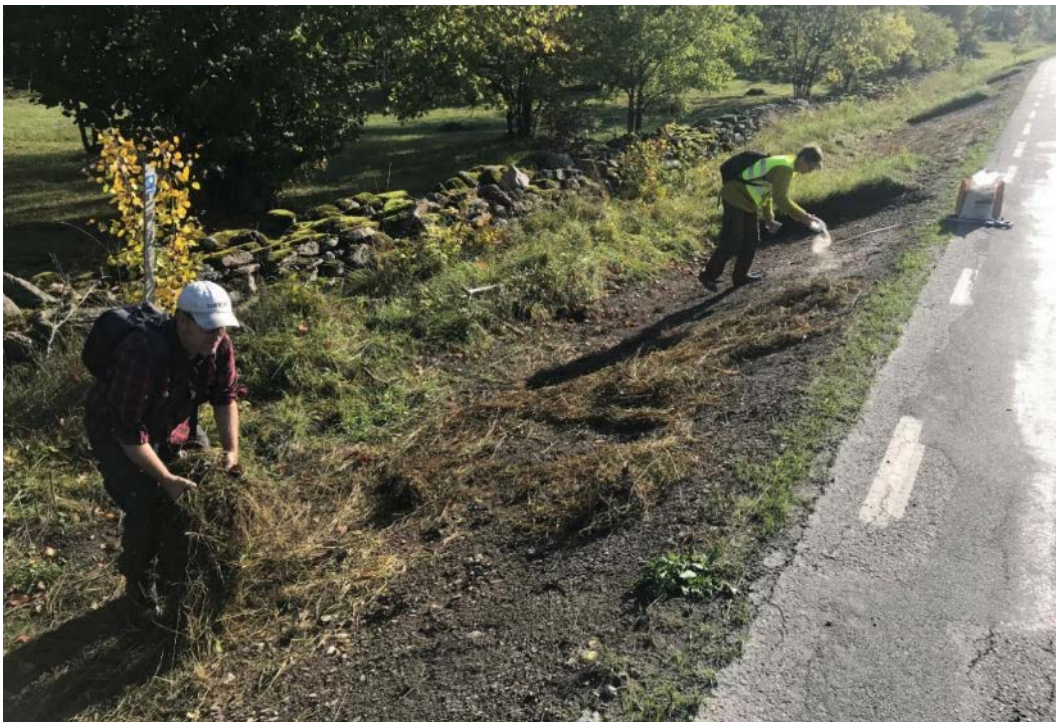
Figure 7. Experimental establishment of meadow flora on recently disturbed ground by sowing collected seeds and by placing hay from the meadow on the roadside. Hällabrottet, province of Närke, Sweden.

The reuse of local topsoil is sometimes recommended, in order to take advantage of the seed bank in the vegetation that was present prior to road construction. Some guidelines are explicitly addressing biodiversity in relation to topsoil reuse (e.g. Trafikverket 2021), some are not (e.g. Mainroads Western Australia 2016).