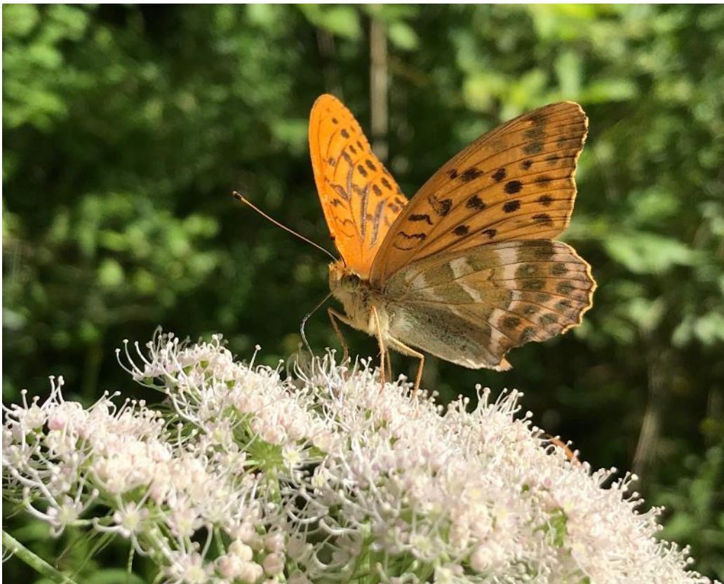
Figure 27. Silver-washed fritillary Argynnis paphia.

Several studies have shown that host plant abundance, and sometimes also their suitability as host plant, explains patterns of insect abundance and distribution in roadside habitats (e.g. Kasten et al. 2016 and Daniels 2017 in USA, Riva et al. 2018 in Canada). The dependence of host plants links insects to a number of habitat conditions and processes that influence plants. In a Dutch study of several insect groups in relation to plant species richness the diversity of weevils, but not of other groups, was significantly correlated with plant species richness (Raemakers et al. 2003). Weevils is a plant eating group with several species being specialised on single or a few plant species.