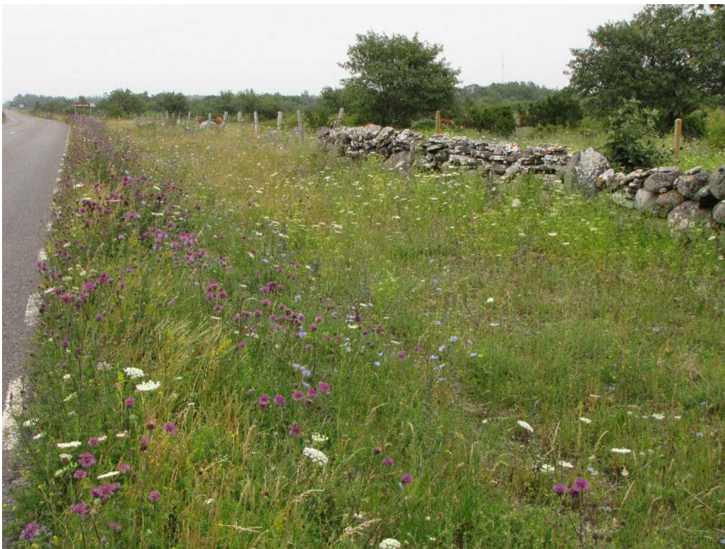
Figure 19. Road verge on lime soil and bedrock, and with the road embankment in a different phase after disturbance. Byxelkrok, province of Öland, Sweden.

Both pH and calcium are found to influence plant species richness in some studies. For example, in 35 road verges in north England (U.K.), Akbar et al. (2009) registered 212 vascular plant species. When relating species composition to environmental variables (in a multivariate CCA ordination), the most important factors identified were altitude, pH, exchangeable sodium and calcium, verge age and macronutrients. Other likely important (but not measured) factors were management activities such as mowing, and trampling. Neher et al. (2013) found that concentrations of Pb, Cd, Cu, and Zn were elevated near the road compared to further away, and along large roads compared to smaller roads. Additionally, roads of all sizes increased soil alkalinity. In the study, the pH in soil next to the road was 7.7 compared to 5.6 in the forest nearby. Also Müllerová et al. (2011) detected an increased pH in soils near roads due to the use of alkaline road materials. In this case, the pH went from 3.9 to 7.6 in an alpine tundra vegetation, which resulted in a changed species composition near the road, replacing the tundra species with meso- and nitrophilous species.