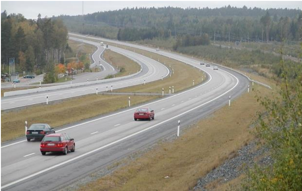
Figure 40. Motorway verges are often wide and may sum up to large grassland areas. Arboga, province of Västmanland, Sweden.

We encourage more explicit studies of wide road verges and other constructed areas in the road environment, which have the largest potential to support viable populations of species.