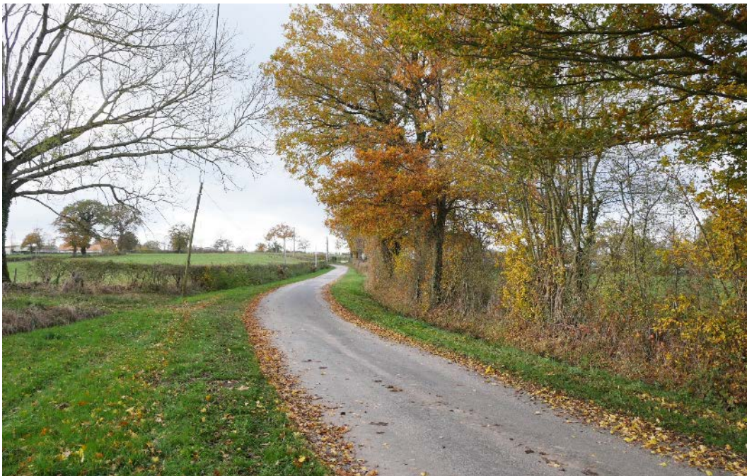
Figure 24. Upper photo: In many European landscapes, roads and field margins are bordered by hedges with or without tall trees. Uxeau, department of Saône-et-Loire, France. Lower photo: If the cutting of hedges stops, the hedges can develop diverse screens of trees and shrubs. Gilly-sur-Loire, department of Saône-et-Loire, France.