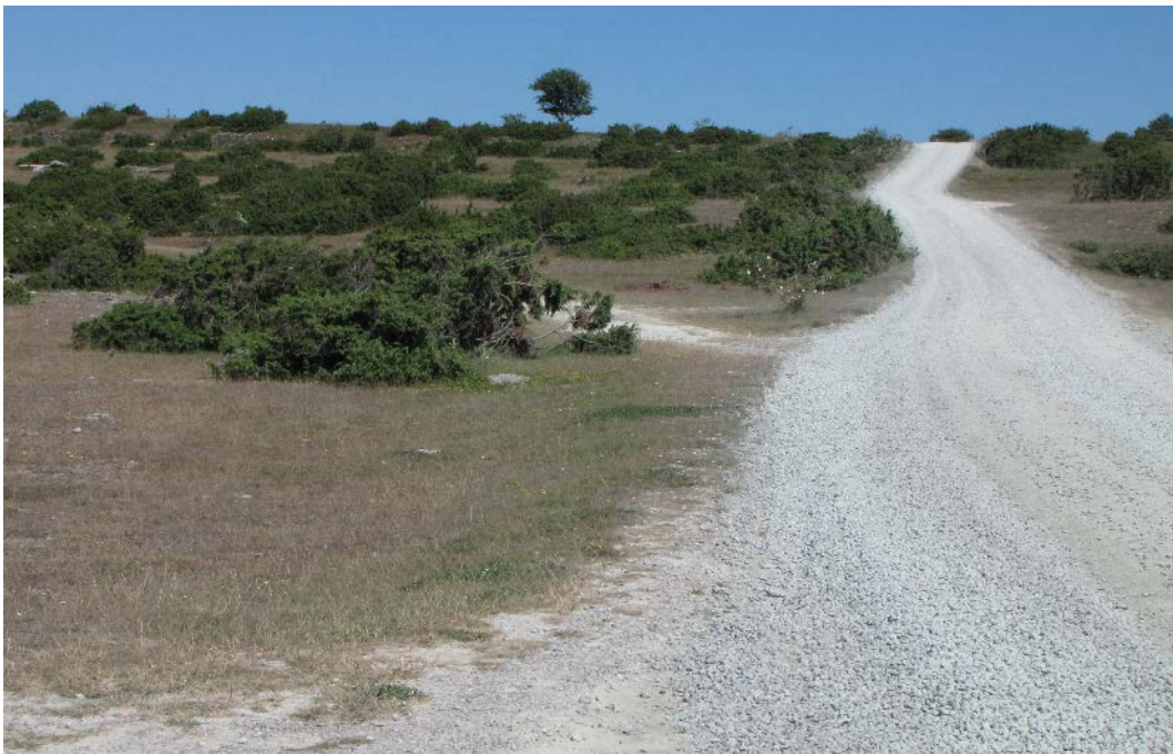
Figure 11. Habitats in dry regions are characterized by no or low cover of trees and of sparse, seasonal herbaceous vegetation. Here, a road makes little difference in terms of openness and occurrence of bare soil. Upper photo: Tomillar vegetation, Torrevieja in the province of Alicante in coastal south-eastern Spain; lower photo: Alvar vegetation, Jordhamn, province of Öland, Sweden.