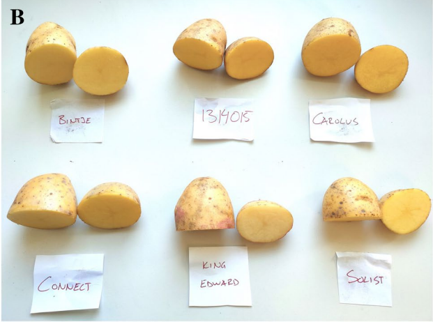
Fig. 3 Tuber shape ( A ), skin and flesh color ( B ) of Svalöf (1314015) vis-à-vis those of other cultivars grown in Sweden and used as checks in multi-site trials