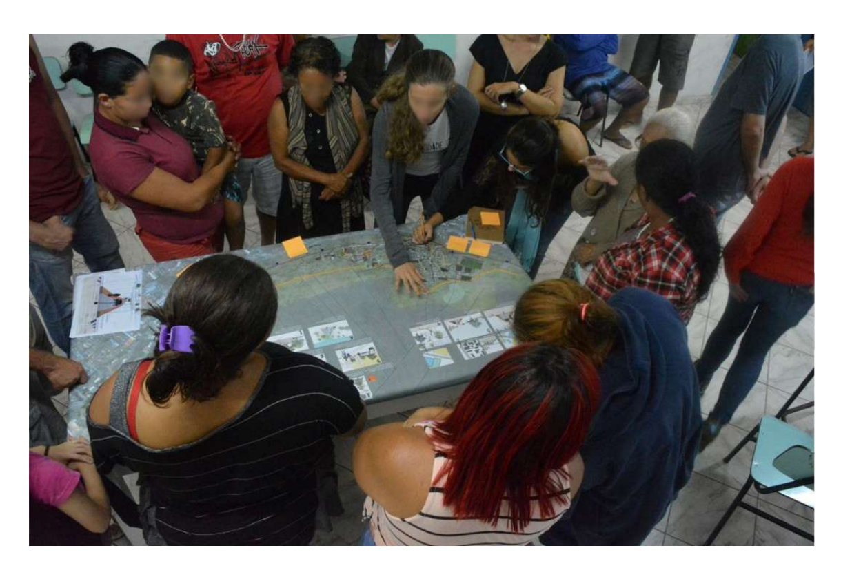
Figure 3. Workshop held at Banhado community for the Popular Urbanization and Land Regularization Plan.