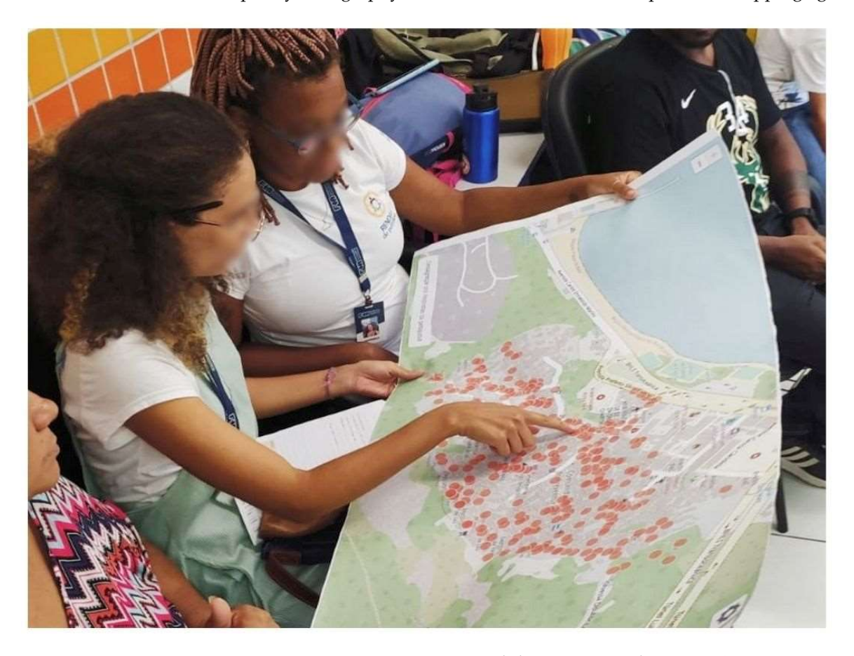
Figure 2. URBE Latam community workshop in Morro do Preventório.

With direct participation from residents, recognizing the importance of their lived experiences and the promotion of a sense of belonging to their community, the project utilized various cartographic resources. These resources included online platforms for data collection (Kobo Toolbox) and participatory mapping such as OpenStreetMap, as well as a combination of Google Maps and printed maps (Figure 2) to create a base map for field mapping by trained residents. Digital maps were also created, along with rapid-updating methodologies for these maps, and a mapping application called T\hat{o} no Prev\hat{e} . With community members as the protagonists of their own narrative, the project promoted emancipatory cartography and contributed to the development of mapping agents.