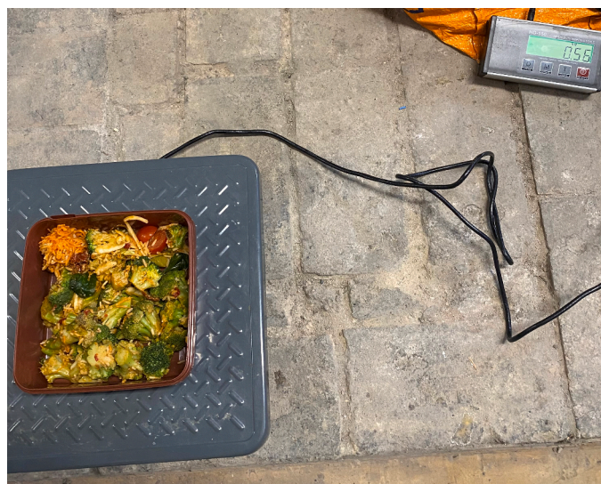
Fig. 1. Electronic balance weighing a plastic container of plate waste consisting of mixed vegetables.

In waste composition analysis, different food waste components, such as pasta, chicken, vegetables, and bread, were sorted by hand into plastic containers. On the first day, degree of separation of the plate waste was decided. Complete separation was not possible due to some waste being in liquid form (e.g., sauces) and mixed form (rice with tiny pieces of vegetables). In such cases, sauces and inseparable vegetables were categorized as the main component (see Table A.2 in Appendix for a complete list of waste component categories). The plate waste was categorized into edible or inedible food waste , where inedible food waste comprised fruit peel and cores, and eggshells. Occasional napkins and spread packages that had accidentally ended up in the food waste bin were separated out into the category other . After the sorting process, the plastic containers containing the various plate waste components were weighed one by one, using a tare function on the electronic balance in between each weighing. The waste category with the largest volume, usually the staple food component of the day such as rice or potatoes, was left in the plastic bag for weighing. The mass of the plastic