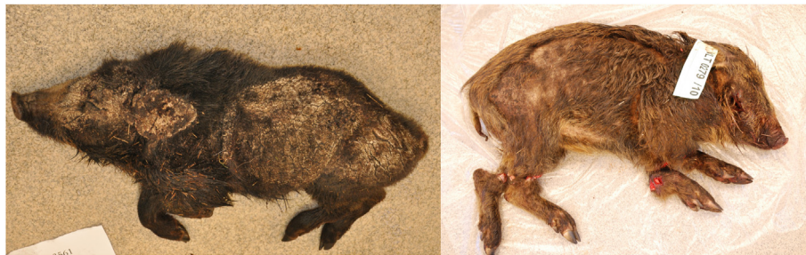
Fig. 1. Two juvenile wild boars, severely emaciated, with apparent body muscle wasting, widespread alopecia and diffuse exudative dermatitis with thick crusts, submitted to the National Veterinary Institute (SVA), Uppsala, Sweden.

Eleven microsatellite markers alongside ITS2 were analyzed from 225 individual mites. These originated from 8 host individuals representing four host species. Little variation was identified in the ITS2 and no fixed differences could be found among the populations (data not shown) indicating this molecular marker is not useful for distinguishing among populations of Sarcoptes mites. For the other 11 loci, 55 alleles were detected. The number of alleles ranged from 3 to 7 for the different loci. Of the 55 alleles, 8 were private (present in only one population); most of these were detected in the wild boar populations (Table 3). Few differences were observed among mites collected from the same animal, although all populations showed variation at some markers. Only two private alleles, one each for marker SARMS 15 and SARMS 35, were present in only one individual mite. For both domestic pig and wild boar, several alleles were present only in mites from the specific host (14 in pig and 15 in wild boar). No alleles were specific for fox or raccoon dog. However, if results from wild canines were combined, eight alleles were specific for these two host species (Table 3). Only six alleles were found