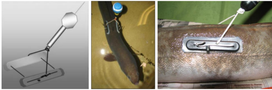
Figure 3 Illustration and pictures of the Økland tagging method used to attach pop-up satellite archival transmitters to European silver eel.