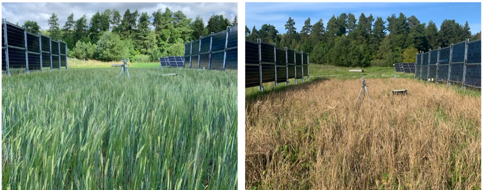
Fig. 3. Barley growing in between the vertically mounted APV system in Kärrobo Prästgård 2023. Left: July 14. Right: September 6.

Barley ( Hordeum vulgare L. variety Dragon [6]) was sown on the APV site on the May 12, 2023 at a rate of 220 kg/ha. Additionally, nitrogen (consisting of equal parts ammonium and nitrate nitrogen) fertilizer with a moderate sulfur content (Axan NS 27-4, YaraBela) was used at a rate of 220 kg/ha. Finally, 60 kg/ha of nitrogen organic fertilizer (Biofer, Gyllebo Gødning) was added at a depth of 4 cm. Thereafter, the field has been left to grow naturally without irrigation or any other agricultural practices (Fig. 3).