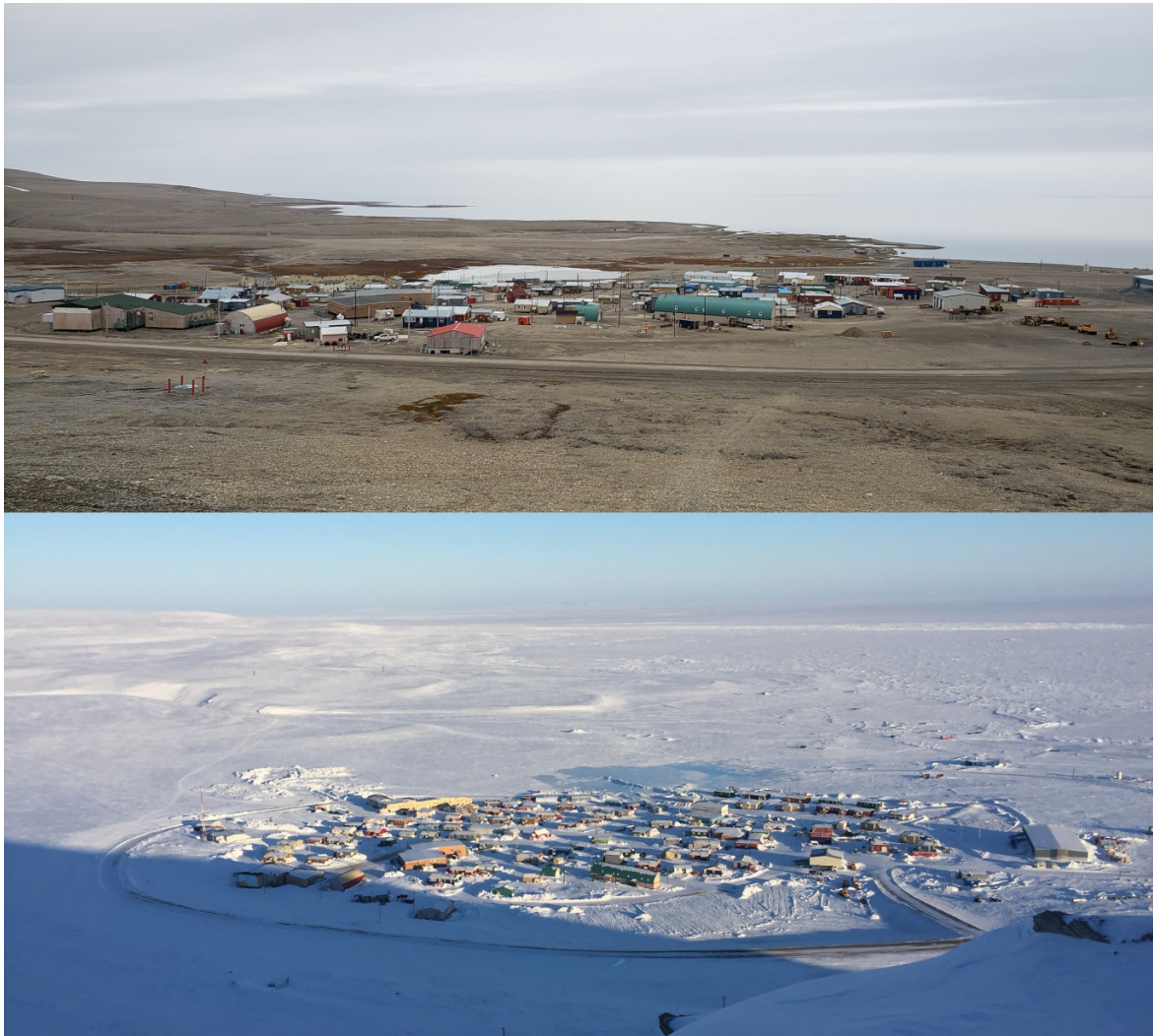
Fig. 9. An image of the community of Resolute, Nunavut in both the fall (top) and winter (bottom). taken in Resolute, Nunavut, September 2019 and March 2018.