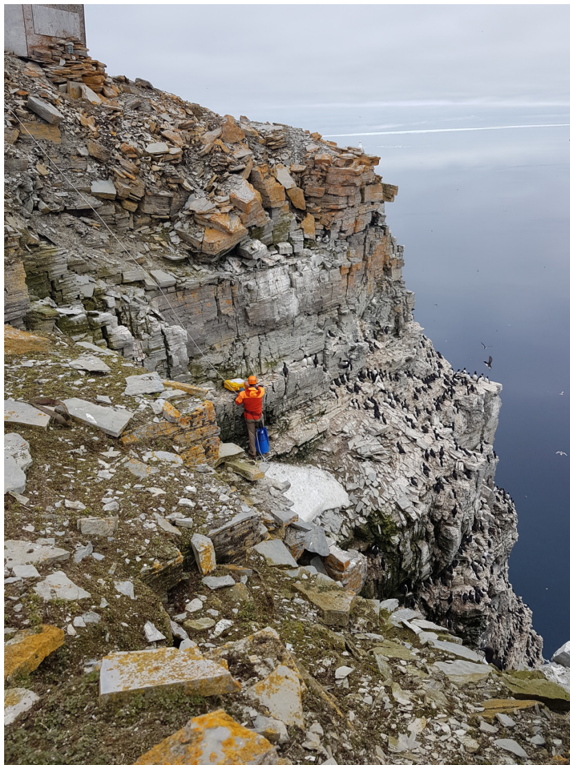
Fig. 6. Monitoring pollution in the Arctic since 1975 using eggs from seabirds. taken at Prince Leopold Island, Nunavut, 2023.

Arctic biodiversity information, such as mapping biodiversity distributions across the Arctic, understanding the drivers of biodiversity patterns, and how this relates to ecosystem function in the Arctic, should be assessed to delineate specific information needs and encourage future research. While it is essential to avoid overstudying at the expense of taking action, fundamental information is still needed to be able to address the various identified threats. Better long-term biodiversity monitoring needs to be conducted in conjunction with environmental monitoring to be able to provide context to data (Gauthier et al. 2013). An overall lack of resources was identified by horizon scan participants as a main barrier to collecting these data, and the development of joint collaborative research projects would be an ideal way to alleviate this barrier (see Table 2). Ideally, these initiatives would lead to a common understanding that fundamental information is paramount for identifying and implementing effective conservation solutions (see Table 2).