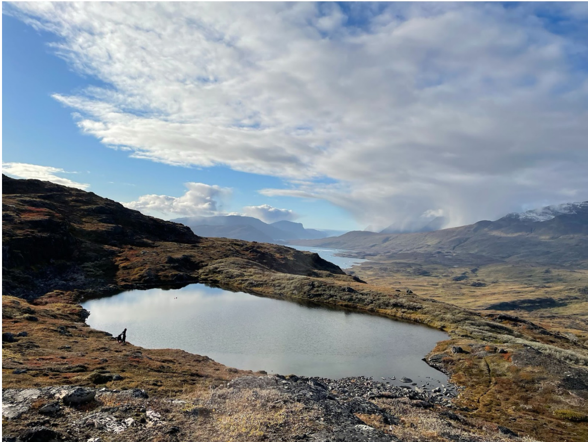
Fig. 4. Example of freshwater lakes in the region, which are home to Arctic char and threespine stickleback. In the background, you can see the edge of the Ice sheet.  taken on a lake in Qassiarsuk, Greenland, September 2021.

between marine and terrestrial ecosystems, supporting high biodiversity that local communities depend on for their livelihoods (see Fig. 4; Wrona and Reist 2013). Given this connection, horizon scan participants recommended that an ideal way to mitigate the barriers of limited access to research sites and resources would be to work with local communities for data collection (see Table 1). With these data, remote sensing applications could then be developed (see Table 1).