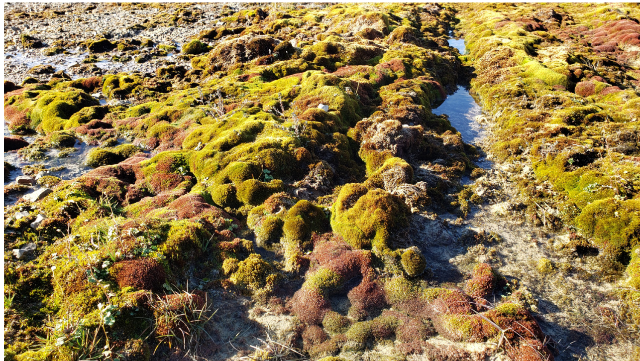
Fig. 1. An example of the diversity of lichen and moss found throughout the Arctic. taken in Resolute, Nunavut, August 2022.

home to 27% of the world's marine mammal species (Payer et al. 2013) and more than 20% of the world's lichenicolous fungi species (i.e., fungi that live on lichens; Dahlberg and Bültmann 2013; Payer et al. 2013). The Arctic also provides habitat for hundreds of species of birds that migrate to the Arctic from around the globe to breed and forage (Sullender 2019). There is even diversity within Arctic sea ice where numerous bacteria, viruses, algae, and sea ice infauna (e.g., ciliates, nematodes, turbellarians, crustaceans) reside (Bluhm et al. 2011; Patrohay et al. 2022).