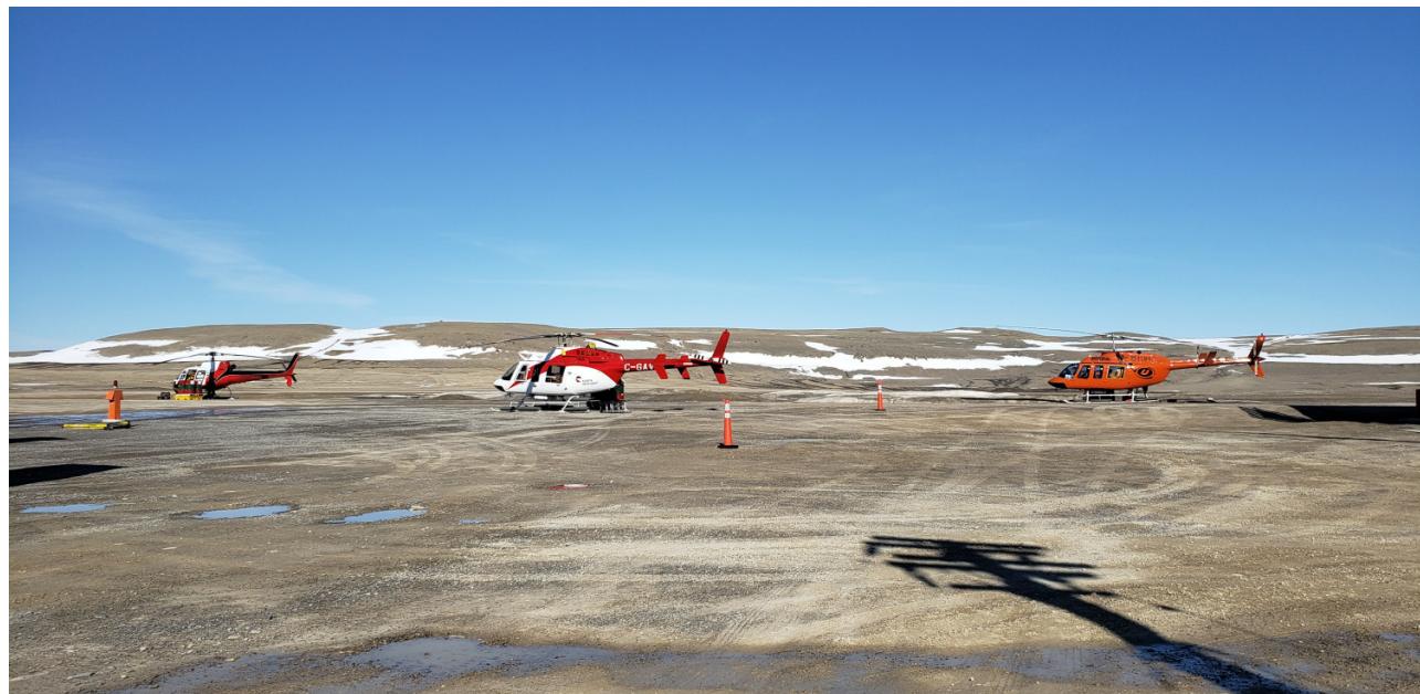
Fig. 8. An extensive amount of research throughout the Arctic requires the use of helicopters to be able to access study sites. The costs associated with positioning the helicopters to the Arctic from the South as well as for caching the fuel these aircraft require for their use is astronomical. These high costs limit the amount of research that can take place. taken in Resolute, Nunavut, July 2019.

problems (Mileski et al. 2018). However, inaction in the conservation of Arctic biodiversity due to not having the full picture is a management trap that must be overcome (DeFries and Nagendra 2017), given the current presence of threats outpacing the length of time it will take to collect data.