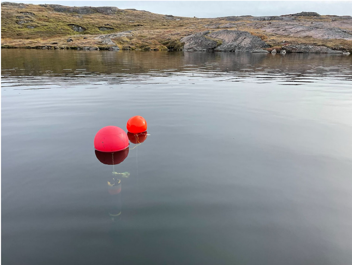
Fig. 7. These buoys and sondes (EXO2) are deployed for weeks at a time to measure high-frequency changes in oxygen, temperature, conductivity, algal biomass, and fluorescent-dissolved organic matter. The aim is to quantify lake metabolism. One of the constraints on such ecosystem monitoring is the need to replace the batteries and service the sensors every few months, making long-term deployments (e.g., over winter) difficult. taken on a lake in Qassiarsuk, Greenland, September 2021.

ever, realizing these improvements in monitoring has proven challenging with many conservation/research programs still falling short in terms of collecting enough or adequate information and being adaptive to the conservation goal (Legg and Nagy 2006; Hillebrand et al. 2018). This includes shortcomings like insufficient scales, lack of resource investment, and even issues with what data are being collected as recognized by horizon scan participants (see Table 2; Hillebrand et al. 2018). Therefore, participants suggested that the development of standard monitoring practices that obtain data that is accessible to all would allow for improved (and more transparent) decision-making and the development of a data archive (see Table 2).