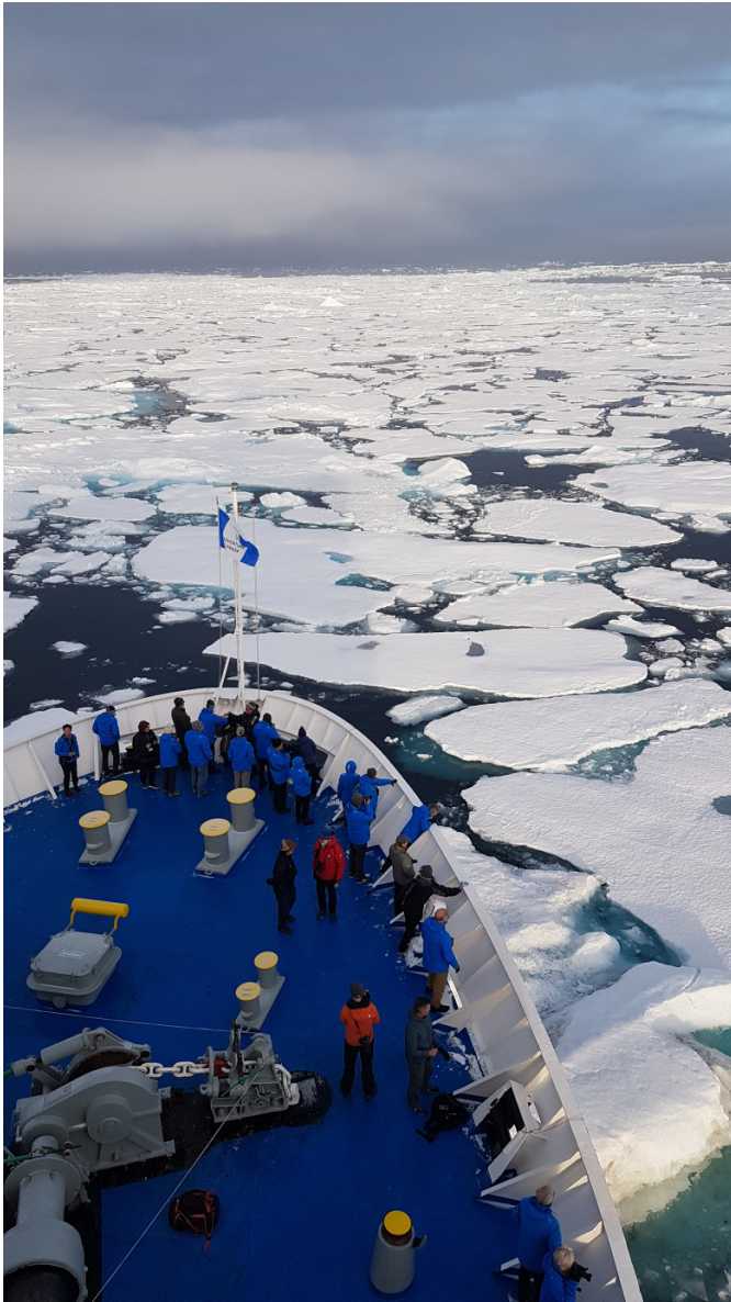
Fig. 5. Passengers on an expedition tourism vessel moving through sea ice in the Northwest Passage, Nunavut.

(e.g., air, noise, greywater, waste, spills) will increase, which has a great potential to negatively impact the environment and aquatic life (Dunlop 2019; Stevenson et al. 2019). Vessel traffic also contributes to direct mortality via ship strikes (Halliday et al. 2022; Qi et al. 2024). To date, most attention has focused on impacts during the open water season, but there is growing investment in industrial icebreaking vessels that can operate year-round such as ice-rated LNG tankers that export gas via the Ob estuary in Russia, and nuclear-powered icebreakers that lead cargo convoys (Wilson et al. 2020). Year-round icebreaking operations potentially pose risks for ice-dependent species, such as ice-breeding pinnipeds, (Wilson et al. 2020) and have been shown to have detrimental physical impacts on seal breeding habitats such as causing mother-pup separations during lactation and