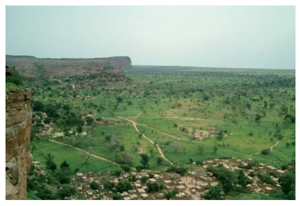
Sahelina parkland Mali

The 'rainwater harvesting' effect of trees and forests is turned into valuable goods and services and is also linked to the impact on the soil surface and the actual consumption of water. Trees generate litter, which improves the organic matter content in soils - a key component to increased water infiltration. Secondly, trees reduce rainfall impacts on soil surfaces that control soil erosion and sediment transport. Although there is limited empirical data on water balances and forests, the well-known benefits of forest ecosystem services can offer a positive regeneration of degraded and water stressed landscapes. Improved provisioning of goods and services as wood, fodder, fruit, medicines, sometimes water flows as well as habitats for diverse flora and fauna are all components that are enhancing the livelihoods of smallholder farmers. Additional benefits such as water purification, build-up of fertile soil systems, and reduced flooding and sediment