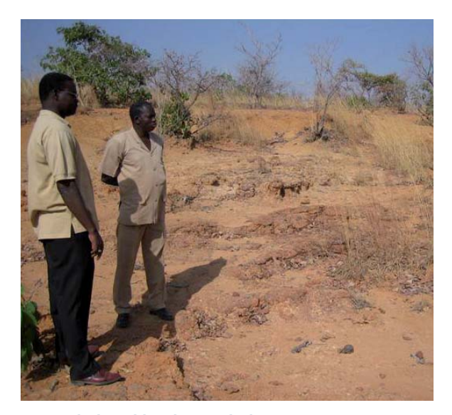
Degraded parklands in Sahel

Removal of trees and lack of regeneration in the parkland is often driven by the introduction of mechanized farming in a cotton and maize rotation system. This is for increased food production and cash incomes for local communities. However in the long term, this production system may lead to a decline in soil organic matter, fertility, high erosion risk and soil degradation (Lal, 1993). Maintaining soil organic matter is important