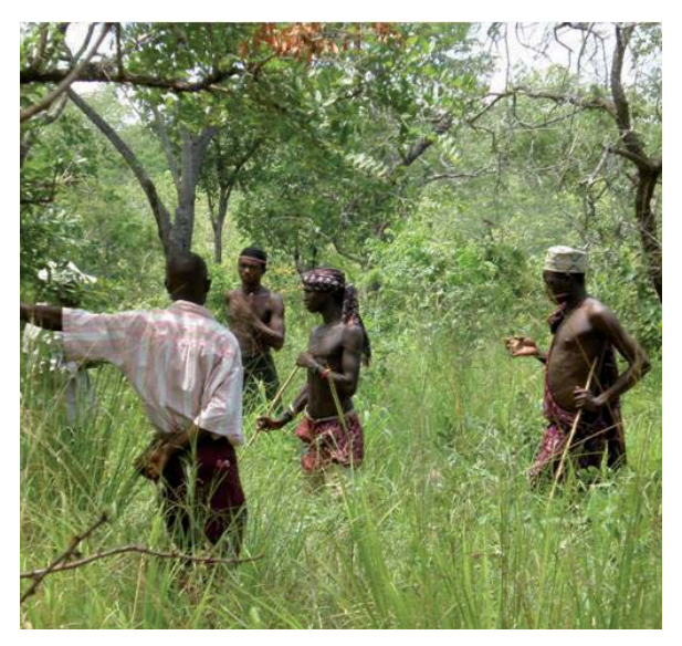
Typical miombo woodland

Management of organic material in soils is crucial for a healthy soil system. Soil organic matter influences soil physical characteristics and availability of plant nutrients. Increased soil organic matter increases soil water storage capacity, and water infiltration capacity. Harvesting, grazing and fire lead to degradation by reducing litterfall; i.e., contributing to reduced organic