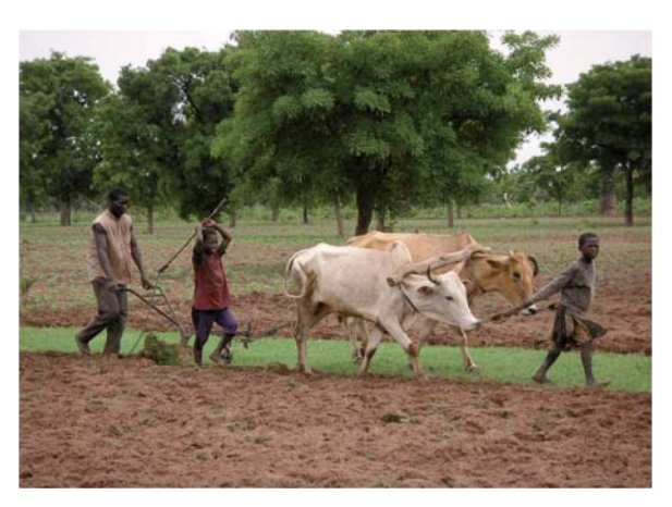
Productive parkland in Sahel