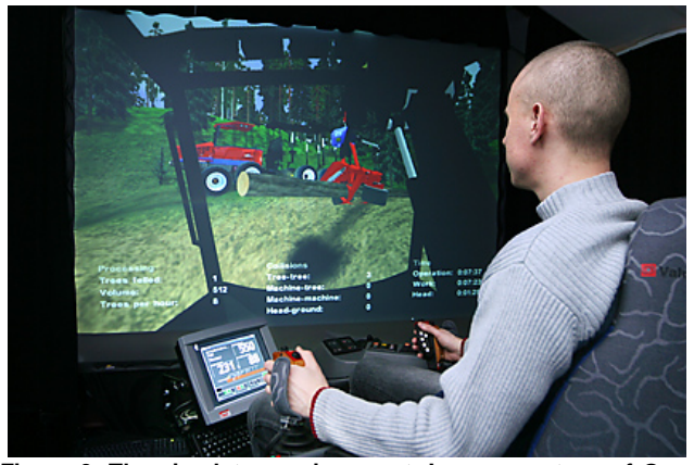
Figure 3. The simulator environment.

As for hardware system, the simulation is developed both for running on a demonstration laptop with a simple interface via keyboard and mouse, on portable simulator mounted in a portable case or in a full simulator environment – used in commercial training applications – for operator-in-the-loop evaluation of new machines, work methods and human-machine interfaces. The hardware components in the full simulator environment includes screen projection, authentic chair and joysticks from forest machine, see Figure 3.