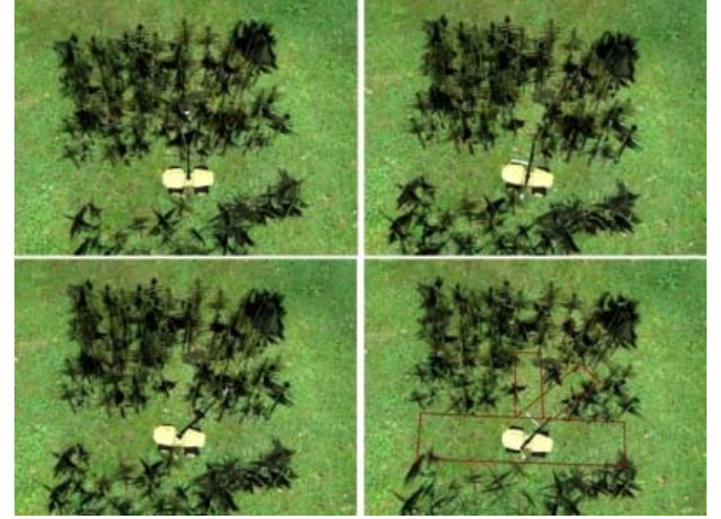
Figure 5. A sample forest stand subjected to corridor harvesting. A strip-road is produced (top left frame) and the harvester head is positioned, a first corridor is harvested (top right frame), the harvester head is re-positioned (lower left frame) and a second corridor is harvested (lower left frame)

technique (corridor, conventional multi-tree, single-tree), machine operation (manual, semi-automation), operator location (on machine, remote with direct visual contact, remote by virtual environment teleoperation). The operator interface as well as properties of the forest stand and terrain may also be varied to see the effect on time consumption.