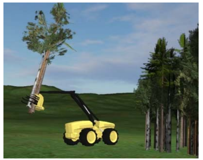
Figure 4. Snapshot from simulation. The machine is gripping several trees with a multi-tree harvester head.

Selection of trees/corridors can in reality be made by projecting a laser pattern to the target. For virtual environment teleoperation [12] of the crane the selection can be made by a simple mouse interaction or any other suitable interaction device. We also plan to test eye and gaze tracking system [19] for high-level commands, e.g., for selecting trees and piles.