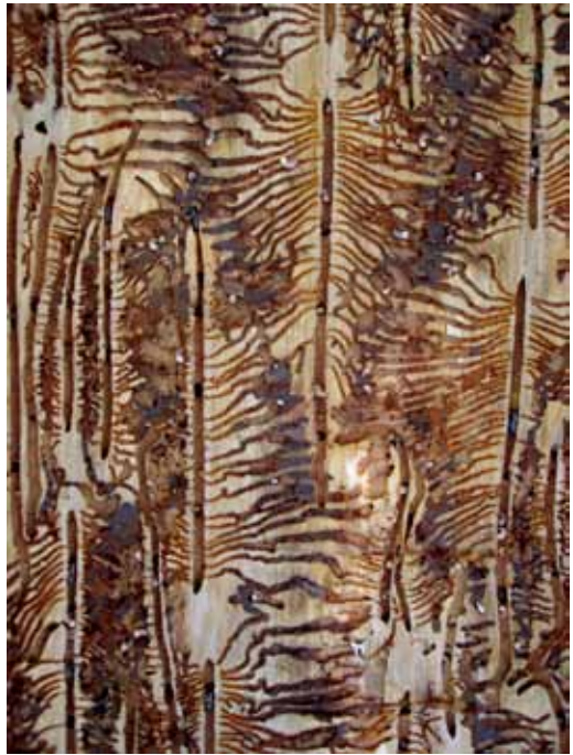
Figure 4. Egg galleries and larval galleries of I . typographus. This species is polygamous, which means that males usually mate with more than one female. From the mating chamber, each female establish an egg gallery where they deposit their eggs in small pockets. Larvae hatch from the eggs, feed on the phloem and thus create larval galleries. At the end of the larval galleries, oval pupa chambers are constructed where they complete the metamorphosis.

Modergångar och larvgångar av granbarkborre. Denna art är polygam, vilket betyder att hanen vanligtvis parar sig med flera honor. Från parnings-kammaren utformar varje hona en modergång längs vilken de lägger sina ägg i små fickor. Ur äggen kläcks larver som var och en gnager sin egen larvgång. Förpuppningen sker i en oval kammare vid slutet av larvgången.