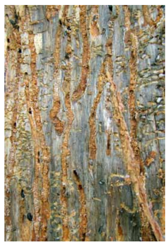
Figure 5. Egg galleries and larval galleries of D . ponderosae. This species is monogamous, i.e., each male mate with one female. The larval galleries of the mountain pine beetle are shorter than the larval galleries of the spruce bark beetle. This is due to the fact that the mountain pine beetle larvae also feed on their fungal associates.

personal communication). Also in Sweden we have experienced a bark beetle outbreak during the last years. Following the storm Gudrun in January 2005, the European spruce bark beetle ( Ips typographus L.) (Fig. 2) has killed about 3.2 million m<sup>3</sup> of Norway spruce trees ( Picea abies L. Karst.) in southern Sweden (The Swedish Forest Agency).