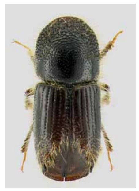
Figure 2. Ips typographus is 4.2-5.5 mm long. It is distributed over Europe and Asia.

Contortabastborren är 3,5-6,8 mm lång. Den är utbredd över större delarna av västra Nordamerika. Arten är en av de viktigaste skadegörarna på skog i världen.