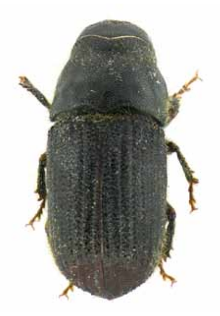
Figure 1. Dendroctonus ponderosae is 3.5-6.8 mm long. It is widespread in western North America. This species is one of the most important forest pests in the world.

Contortabastborren är 3,5-6,8 mm lång. Den är utbredd över större delarna av västra Nordamerika. Arten är en av de viktigaste skadegörarna på skog i världen.