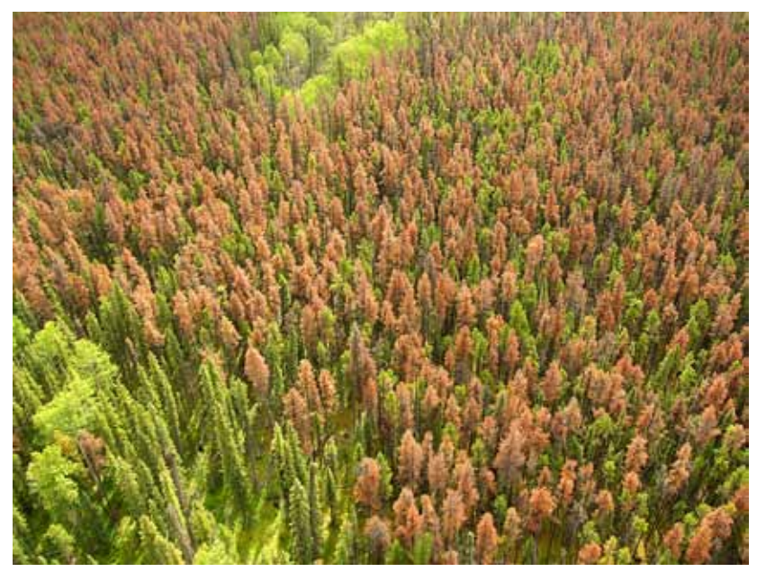
Figure 3. A lodgepole pine forest in Canada, with a large proportion of trees killed by D. pon derosae . This species has killed 60 times more volume of trees than I. typographus.

Granbarkborren är 4,2-5,5 mm lång. Utbredningsområdet för arten sträcker sig över Europa och Asien.