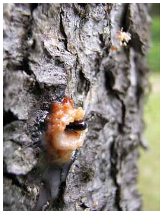
Figure 8. Dendroctonus ponderosae attacks a lodgepole pine. The tree defends itself with resin.

Contortabastborre angriper en contortatall. Trädet försvarar sig med kåda.