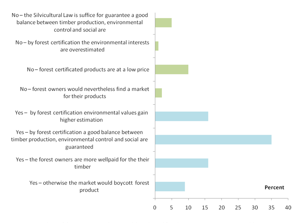
Fig. 2 Proportion of forest owners that considered certification as a proper way to achieve a sustainable forestry.

Over time, the attitude towards forest certification has improved. After completing certification, 85% of the respondents stated that they had a positive attitude towards the scheme, compared to 65% who felt positively towards it when they decided to join. Of the 29% who claimed that they had no opinion at the time of joining, 68% had become positive, while 26% still held no opinion, and 6% were negative. (Not presented in table.) Although the majority stated that they had not become more active, it seems that there was a general increase in management activity. The 55% of all respondents who identified themselves as forest owners with "well managed forests" as a primary objective had become more active than the 37% of all respondents who cited "good profitability" as their primary objective (Table 7). Thus, it seems that those motivated by a desire for "well managed forests" were prompted into activity more than those who cited profitability as their main motive.