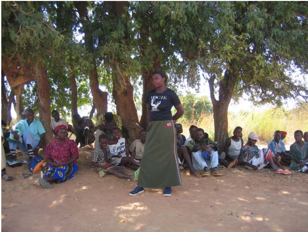
Picture 3. Young woman raising her voice during a stakeholder meeting on land rights issues in Niassa Province, Mozambique.

The future availability and success of biofuel production also depends on a number of variables that are difficult to predict. These include droughts, fluctuating oil price, other events that reduce feedstock production and market mechanisms that can make other uses of the feedstock more attractive for producers. 47