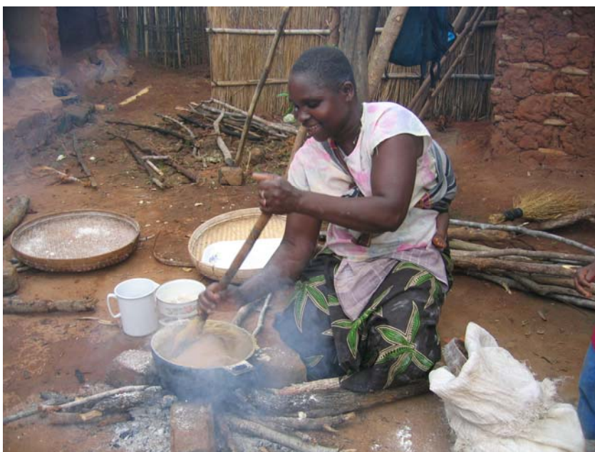
Picture 1. Domestically used, liquid biofuels can replace fuel wood and thereby reduce health risks associated with smoke, primarily benefitting women and children.

Availability of energy is fundamental to intensifying agriculture, industrial development and pro-poor growth. Locally produced liquid biofuel, e.g. biodiesel, could lead to national and local benefits such as reduced pressure on forests, reduced dependency on oil imports and limited exposure to volatile international prices.