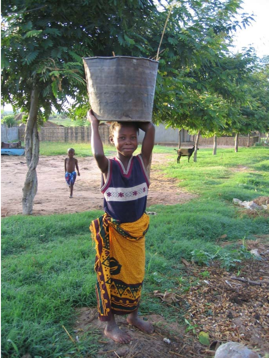
Picture 4. Women and girls in many developing countries spend a lot of time fetching water. Sugar cane and other water demanding biofuel crops could threaten the access to water, thereby increasing the work burden for women and girls to find and fetch water to the household.

Water pollution is a widespread problem both in oil palm and sugar cane producing areas, as well as in the mills that produce biodiesel and ethanol. Both palmoil and cane mill effluents tend to be rich in organic matter. The decomposition of the nutrient loads that result from these effluents reduces oxygen levels in the water, affecting natural biochemical processes and the species that inhabit those freshwater ecosystems. 63 Oil palm plantations have been criticised for their use of herbicides. The most commonly used in Southeast Asia's plantations is paraquat, and many employed pesticide sprayers have shown acute paraquat poisoning symptoms. 64