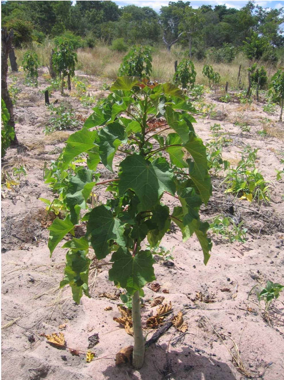
Picture 2. Small scale jatropha plantations have proved to be a potential boost for e.g. local energy security, heat and electricity. However, despite drought resistance, commercial plantations need fertile lands and irrigation for high yield production. Picture from Mozambique.