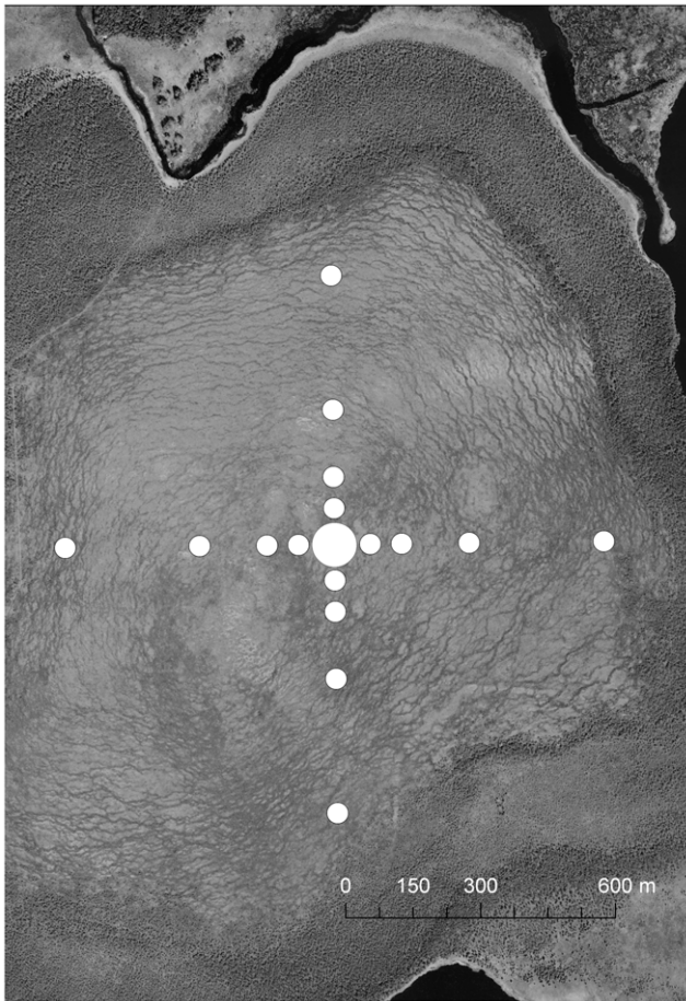
Figure 1. Map of the field site and study design at Jordbärs-muren. The mother colony was situated in the centre: pots were placed at 1, 5, 10, 30, 50, 80, 150, 300 and 600 m in each direction at in total 36 sampling stations. Note: The area with the sampling stations from 50 m and inwards are represented by a large white circle.