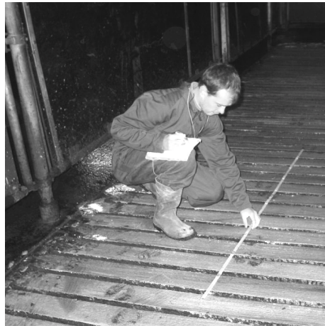
Figure 4. Measuring the trackway

All measurements were made by the author of the thesis (E.T.).