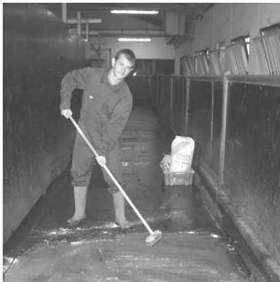
Figure 2. Preparing the walkway with lime powder and slurry

Measurements in Paper II included all parameters mentioned above with the exception of step width and step abduction-adduction. The measurements were taken from four consecutive strides using a ruler and an angle meter (Fig. 4). The measurements and their reference points are described in detail in Paper I. The walking speed of each cow was measured with a stopwatch.