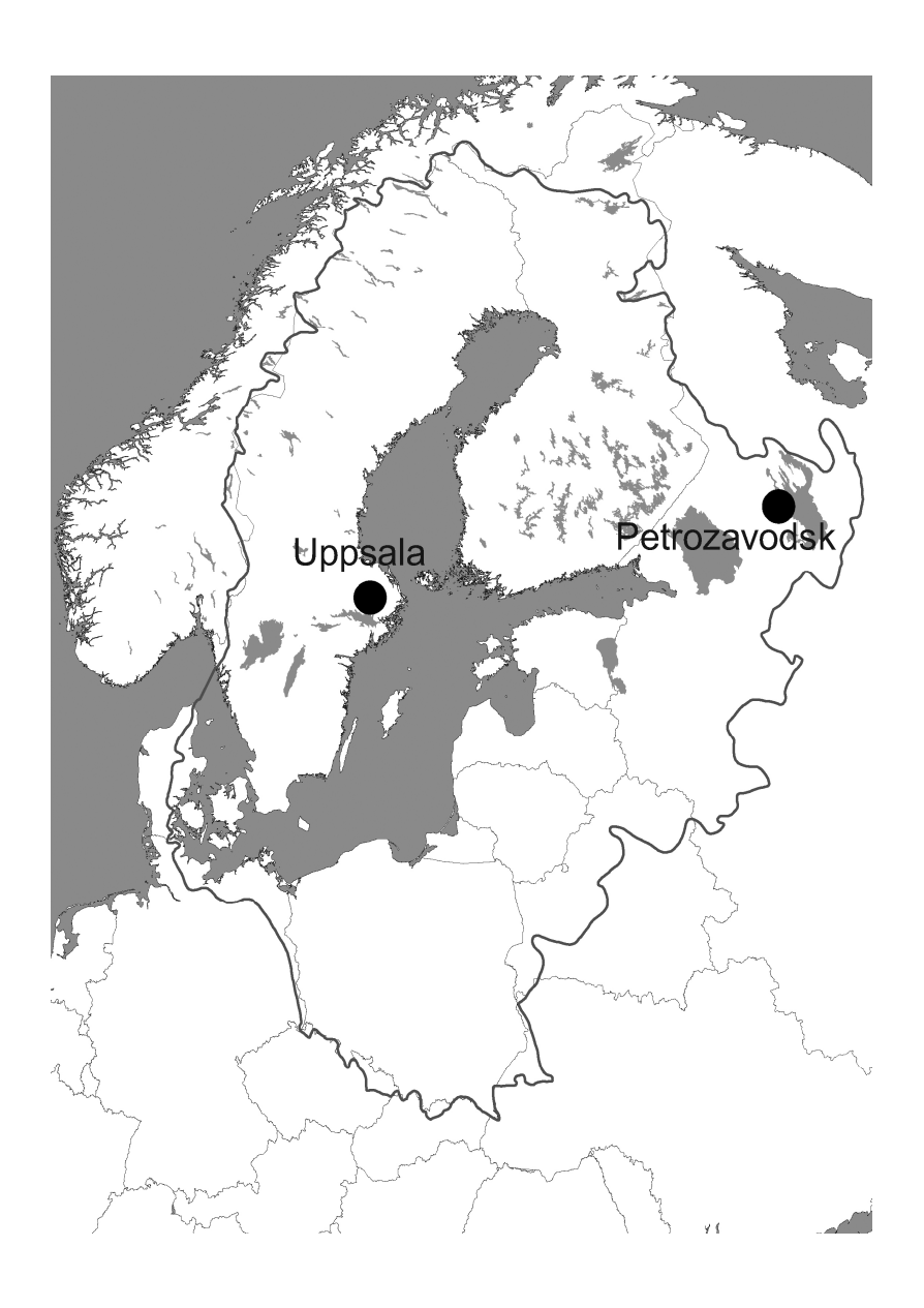
The Baltic Sea Region and the two main cities for the study.