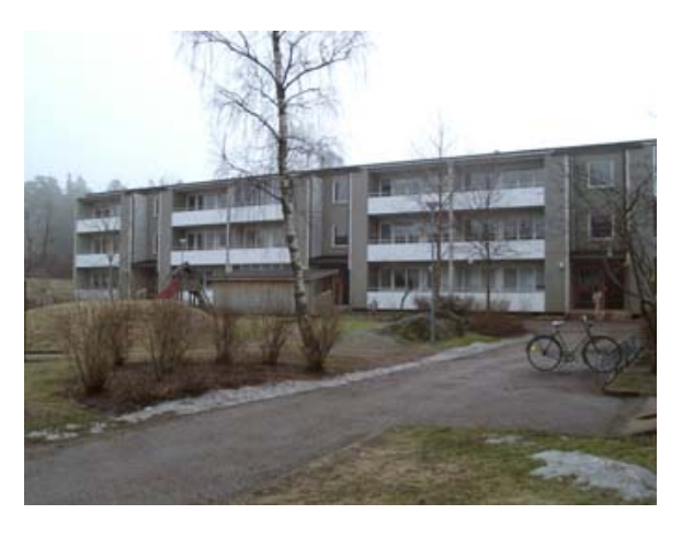
Figure 4. Multifamily houses on August Södermans Road.

In all of Gottsunda district there are about 9,000 inhabitants. There are around 760 people living in the part of August Södermans Road which is investigated in this study. There are a relatively large number of young families with children in the area. The area has a larger share of immigrants, students and old people than Uppsala as a whole (Uppsala municipality, 2003).