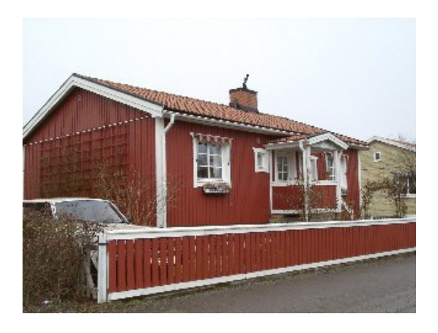
Figure 2. A typical small house in Kungsgärdet.

A nearby green area is the open fields of Ekeby valley, located to the west, consisting of grass fields, allotment gardens, a storm water pond and football fields. To the east is the City forest, a large public forest park. The residential area has a few smaller parks along the Aros Street with alleys of birches and some mid-scale green areas and a playground. The inner green structure is characterised by sparse alleys dominated by trees planted by the entrance side of the house lots – mainly cherry and apple trees.