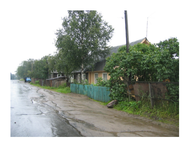
Figure 5. A typical view in the small house area in Perevalka.

The history of Perevalka began from the time of the establishment of large forest industries around Petrozavodsk in the 1930s. For this purpose Lososinski Lespromhoz (a Soviet forest industrial organisation) was established. Timber export was carried out in two main directions: along the Lososinskaya and Lezhneva roads. A Posolok (a Soviet village) was built for people engaged in logging. This Posolok included barracks and private houses for the workers. A timber yard was placed where the bus station is located today. Workers transported timber from the yard to the train – in Russian the verb is "perevalivali" – hence the name of the area Perevalka. There were about 1500-1600 inhabitants at that time. During the Second World War there were five concentration camps in the area and a lot of houses were destroyed. Most houses are from the middle of the 20<sup>th</sup> century, from the end of the war period (Tatiana Solovjova, pers. com. 2003).