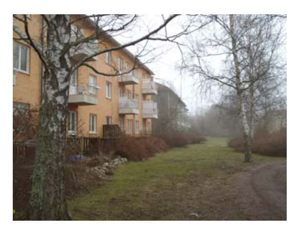
Figure 3. Multifamily houses in Lassebygärde

Today, more than 200 people live in the 137 flats in Lassebygärde. Only around 10 of the residents are children under 16 years of age (in the year 2000). The area has many pensioners and students and few families. 90% of the residents are of Swedish or Nordic origin. The turnover was rather high - around 18%/year in the year 2000 (Uppsalahem, 2002).