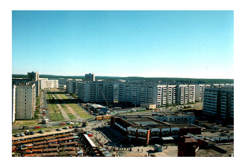
Figure 6. Multifamily houses, the market place and the park alley in Drjevlanka.

collected frequently by the local authorities.