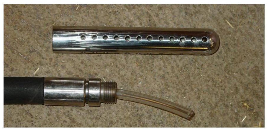
Fig. 2. Esophageal tube used for collecting rumen fluid.

Within 2 min after collection, pH was registered (MP125, Mettler-Toledo, GH-8603, Schwerzenbach, Switzerland). A test was conducted before the Kungsängen study started on a rumen-fistulated cow where rumen samples were collected through the fistulae and compared to a rumen sample collected by the esophageal tube. Virtually no differences in pH were detected between fluid collected by means of esophageal tube or through the fistulae, indicating that saliva contamination was negligible (data not presented). The rumen fluid was also analyzed for volatile fatty acids (VFA), ammonium nitrogen (NH<sub>3</sub>-N) and protozoa counts.