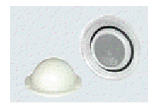
FIGURE 1: Specimen holder made of low background silica plate used for XRD measurements on a small sample size.

the refined parameters, including the shift of the E_0 value (for which k = 0), using different models and data ranges, indicate that the absolute accuracy of the distances given for the separate complexes is within ±0.005 to 0.02 Å for well-defined interactions. The "standard deviations" given in the text have been increased accordingly to include estimated additional effects of systematic errors.