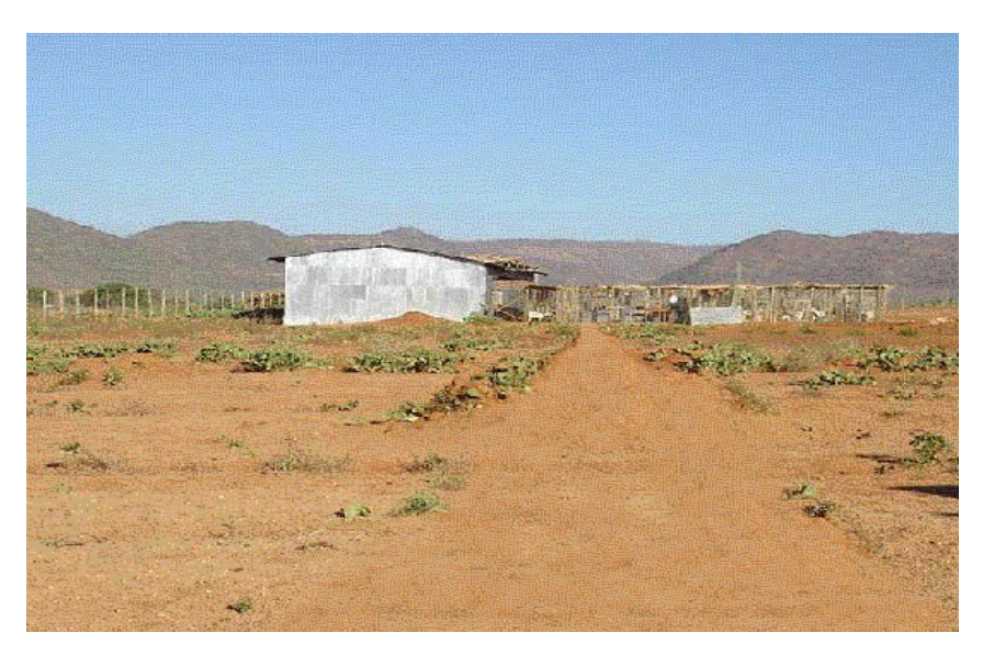
Fig. 1. Errer Valley Reseach Station

The resident farmers communally own the grazing area outside the research station and animals belonging to the research station are also allowed to graze there. Rocky hills, ravines and a variety of indigenous browse species and grasses characterize this grazing area. The livestock species owned by the farmers are cattle, camel, goat, sheep and a few donkeys.