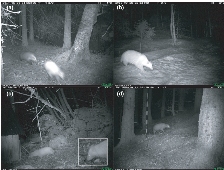
FIGURE 3 Records of leucistic Eurasian badgers ( Meles meles ) in central Norway. (a) First record of a leucistic badger in Norway. A regularly colored badger (left) chases the leucistic badger (right) showing the clear difference in coloration. (b) Second record of a leucistic badger at a different location. (c) Third record of a leucistic badger at a third location, inset: close-up of the head showing the dark nose. (d) Last record of a leucistic badger at the same location as A but from a different camera angle

and HA2 were 70 km apart, we conclude that we have observed at least two individuals.