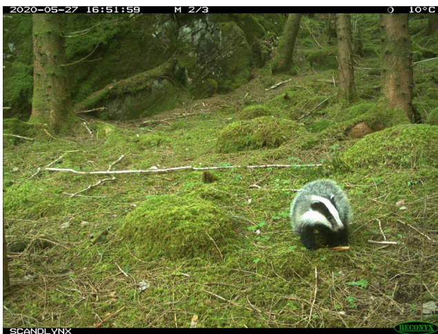
FIGURE 1 Camera trap image of a regularly colored badger from the study area, showing the distinct gray-brown body, dark legs, and black and white facial marks

The Eurasian badger normally has a distinct coat coloration with a gray-brown body, dark legs, and black and white marks on the head (Figure 1; Kruuk, 1989; Roper, 2010). Albino, leucistic, melanistic, and erythristic Eurasian badgers have been described before (Roper, 2010) and seem to occasionally be sighted in the UK (Badger Trust, 2021). However, to date these observations have not been recorded in an accessible format, such as in the scientific literature, making it difficult to assess the frequency of occurrence and study the causes and consequences of coat color anomalies in Eurasian