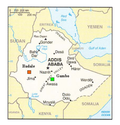
Fig. 2 . Map of Ethiopia showing the study sites.