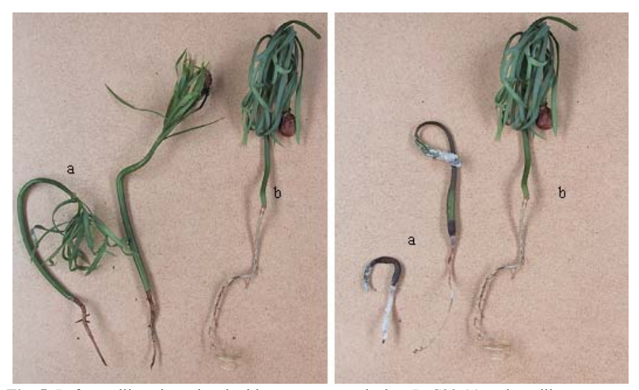
Fig. 5. Left: seedlings inoculated with F. oxysporum isolate PoC23 (a) and seedling from the control treatment(b). Right: seedlings inoculated with Polyporus sp. isolate Po-95 (a) and seedling from the control treatment (b).

agents in suppressive soil (Farvel, Olivain & Alabouvettee, 2003). The Polyporus sp. isolates caused both pre- and post-emergence damping-off resulting in no surviving seedlings (Fig. 5). Isolates of this species were highly pathogenic under