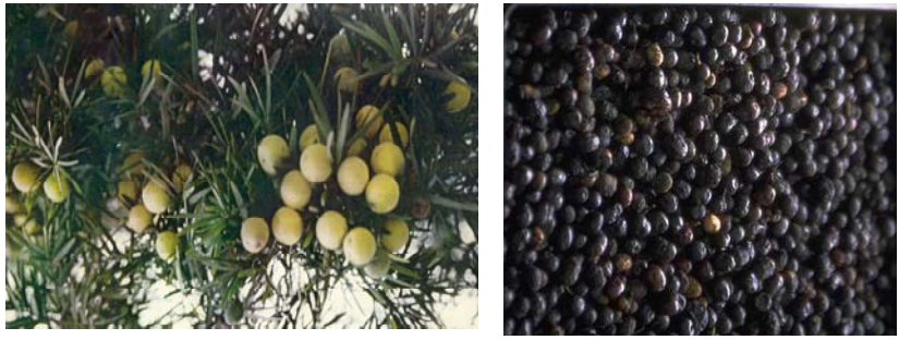
Fig. 1. Mature female cones (fruits) of P. falcatus (left) and P. africana (right).